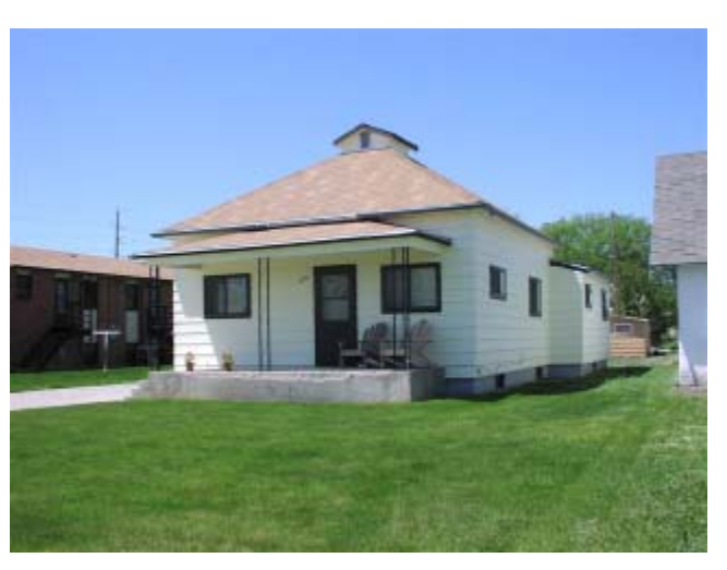
Homes financed through the Guaranteed Home Loan Program in Hayden and Burlington, CO