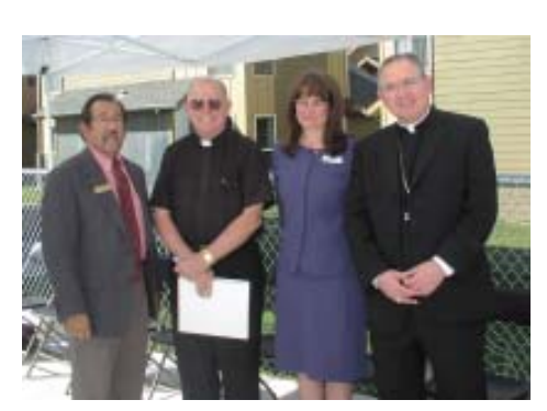
Plaza del Sol