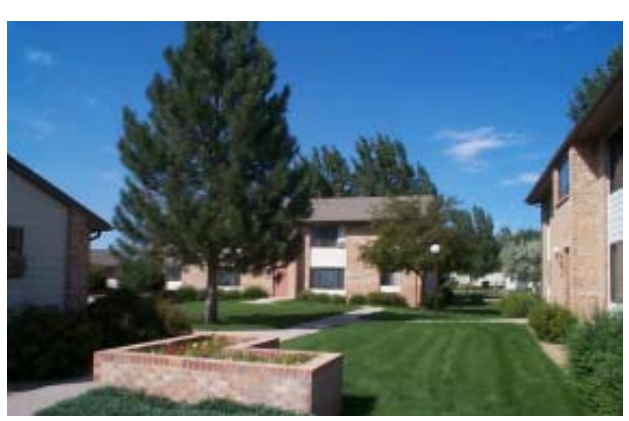
Multi Family Housing Complex of the Year, Vernon Park Apartments in Brighton, CO