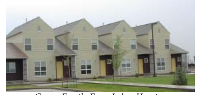
Center Family Farm Labor Housing

In Fiscal Year 2003, Colorado welcomed the addition of three new multi family housing complexes to our portfolio. The new complexes are: Center Family Farm Labor Housing in Center, Plaza del Sol Farm Labor Housing in Greeley, and Springtree Village Apartments, a senior complex in Durango.