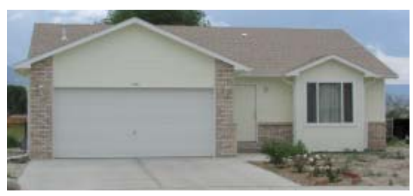
Home financed through the Mutual Self Help Houisng Program in Grand Jucation.