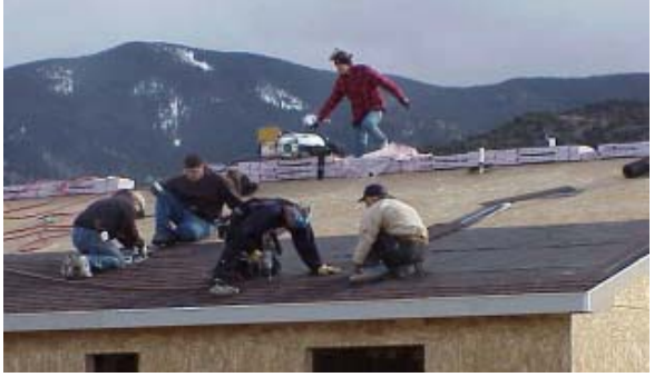
Families building a Mutual Self Help in Poncha Springs.