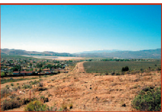
The North Valleys area showing posttreatment results.