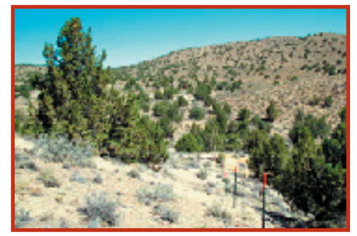
Part of the Hungry Valley area prior to treatment.