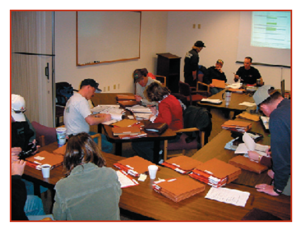
State and federal agency personnel reviewing the community assessment files for accuracy and consistency.

A web site showing progress in these communities is at: www.ut.blm.gov/ ccifc/WUIFocusArea.htm