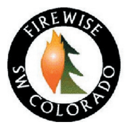
Logo for Firewise-Southwest Colorado.

Southwest Colorado's new Firewise Council will host a half-day symposium for homeowners that will focus on insurance and legal issues, grant opportunities, evacuation plans, and more. Another workshop will offer considerations regarding the emergency evacuation of livestock and pets during a wildfire. Also on the agenda are tours to demonstration sites showing hazardous-fuels treatments on both public and private land, fire department open houses, and workshops on beetle infestations, forest health, and water-wise irrigation.