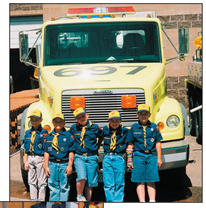
Scouts pose in front of BLM

Department. They left with educational materials including their own Smokey Hat, and their very own official Casper BLM fire t-shirt.