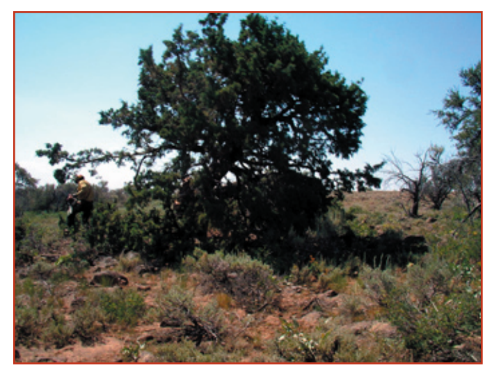
A Lower Snake River District BLM fuels crew member walks away from a freshly cut juniper. Fuel such as this can be removed and used as biomass material or left in place to provide nesting habitat for native birds, cover for small animals, and additional soil nutrients.

Additionally, many rural communities reside within designated areas in