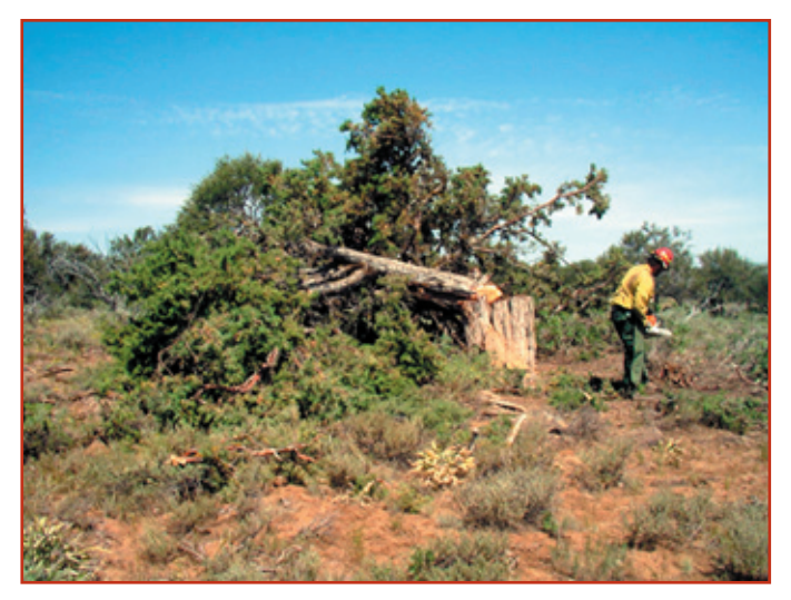
Fuels crew member cutting juniper trees during the treatment project.

need of juniper treatment throughout southern Idaho. In order to involve the citizens of these communities, the BLM and its resource advisory council provided the workshop to address effective collaboration with the public, and to identify potential economic and social benefits involving project implementation.