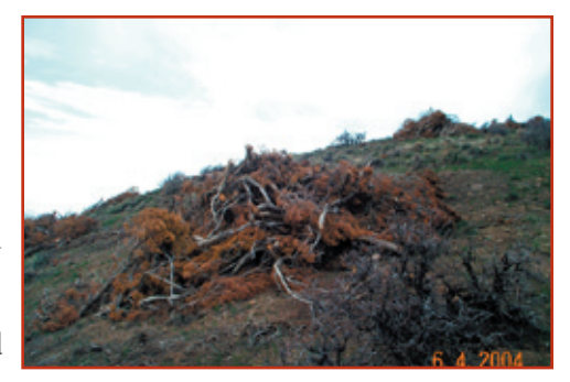
The fuel type on the Buckskin project is shown in this photo.

The Pocatello-Inkom area is listed as a National Ambient Air Quality Standard