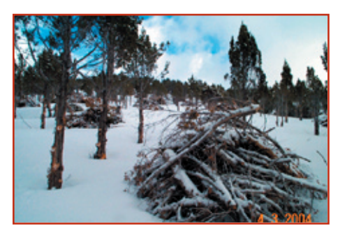
Piles of fuel on the Portneuf Westbench Project prior to the prescribed burning.

Particulate Monitors. Real-time monitoring provides light scatter information on concentrations of particulate matter in the air at any given time. This is valuable information as it is available during the time in which smoke is being generated and can be used to compare relative magnitudes and observe trends over time. Ambient air monitoring began several days prior to burning in order to adequately characterize background conditions and the fire's contribution to local ambient particulate matter concentrations.