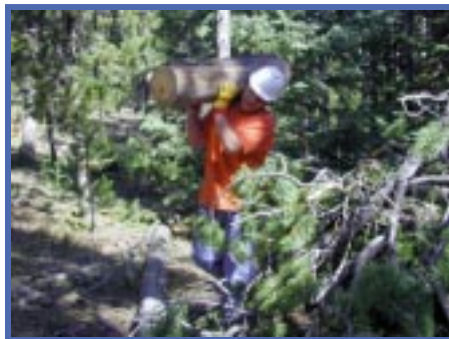
ROTC student gets a workout on the Muddy Mountain project.