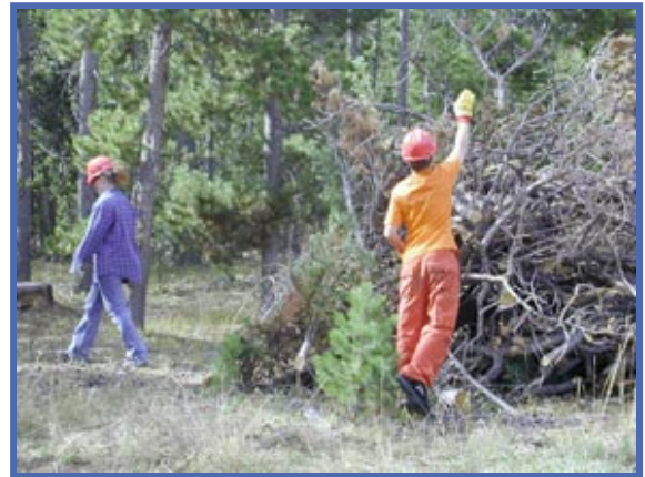
ROTC student piles brush on joint project.