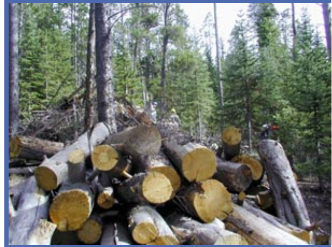
Fuel loads prepared for removal during National Public Lands Day.

ROTC students moved and prepared slash piles while learning about forestry and fuels reduction. Activities began at 10 am and ended at 4:30 pm. The National Guard provided transportation for the students, and lunch was provided for participants by BLM.