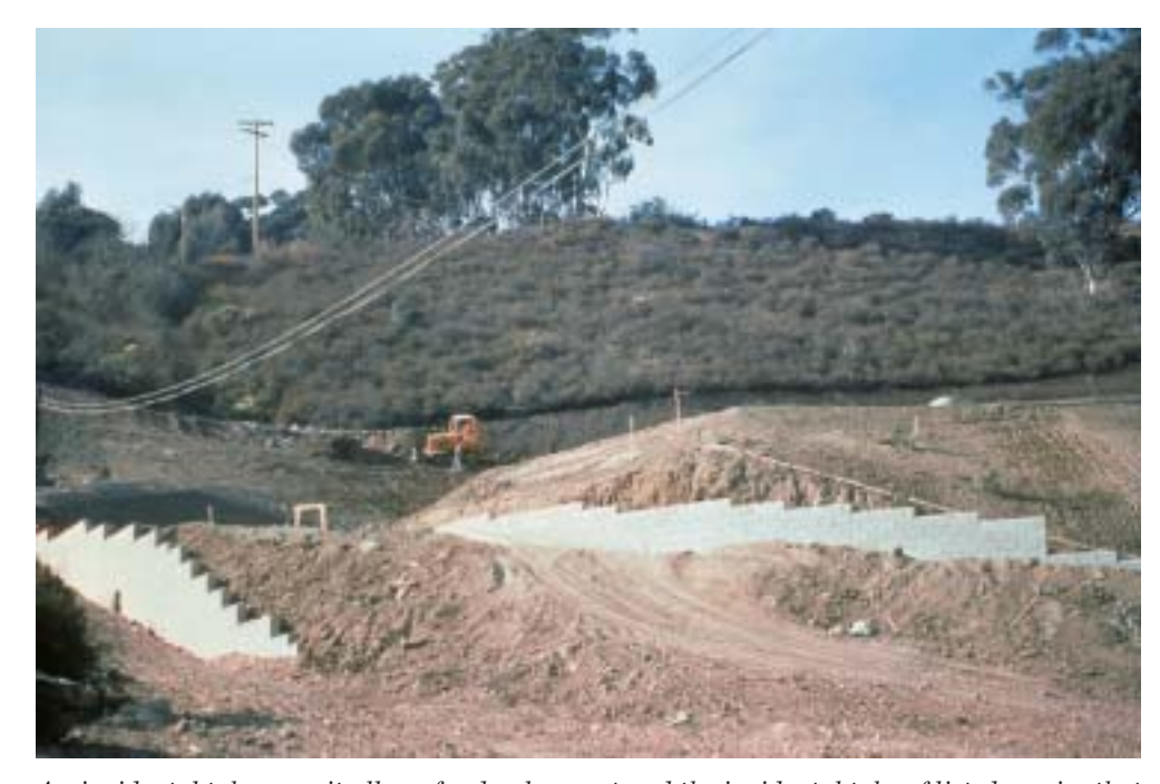
An incidental take permit allows for development and the incidental take of listed species that may result from the otherwise lawful activities. To offset any such take, the developer agrees to follow conservation measures set forth in a habitat conservation plan.

The activities authorized by permits differ depending on whether the species affected