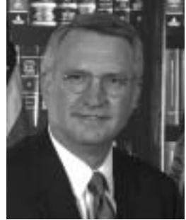
JOHN P. WALTERS

The President directed our attention to recent good news: survey results showing that drug use among American teenagers has dropped 11 percent in the past two years. This achievement not only marked improvement not seen in a decade, it also met the national goal the President set in February 2002 to reduce drug use among 12- to 17-year-olds by 10 percent within two years.