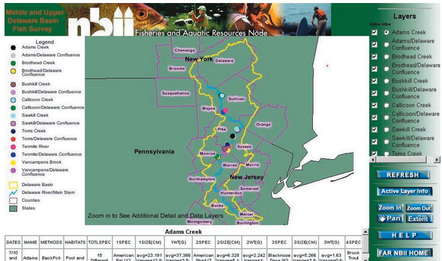
Delaware River basin mapping application showing field sites and summary fisheries data.

Find us on the Web at < http://far.nbii.gov >.