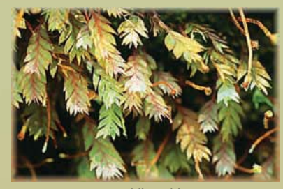
goblin gold Schistostega pinnata

▶ Goblin gold – Some of the largest and healthiest known populations of this rare moss are on the Olympic Peninsula.