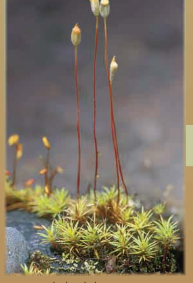
juniper haircap moss Polytrichum juniperum