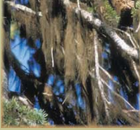
horsehair lichen Bryoria fremontii

Native Americans made the poisonous horsehair lichen edible by steaming it in a pit oven for two days.