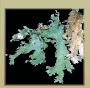
old-growth specklebelly Pseudocyphellaria rainierensis

▶ Flag moss – This moss has been found only three locations in Washington.