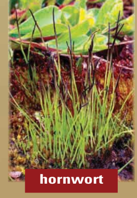
dotted hornwort Anthoceros punctatus

available. Instead of producing seeds, bryophytes can either reproduce sexually by means of spores, or asexually when small pieces break off and grow into new individuals.