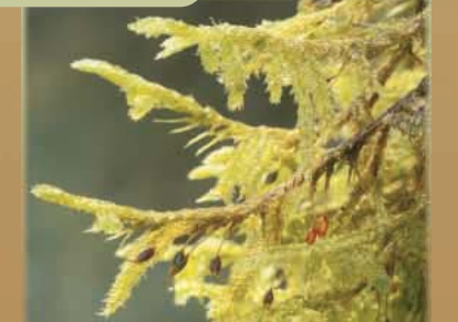
Douglas' neckera Neckera douglasii