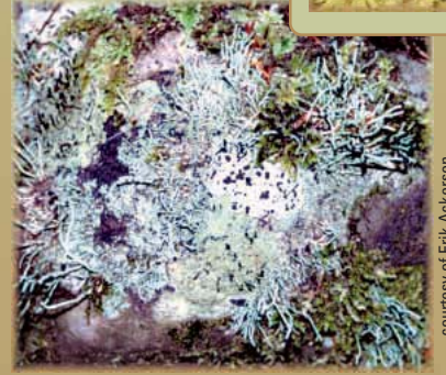
△ A variety of bryophytes and lichens are able to grow on a surface (substrate) as inhospitable as rock.

The age in years of stair-step moss can be determined by counting the number of "steps."