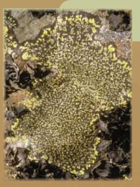
map lichen Rhizocarpon geographicum