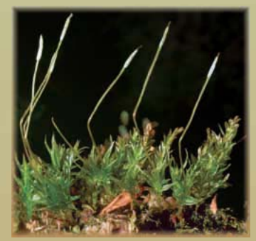
bent-kneed four-tooth Tetraphis geniculata

► Bent-kneed four-tooth – This rare moss is found in association with decayed logs and other large woody debris.