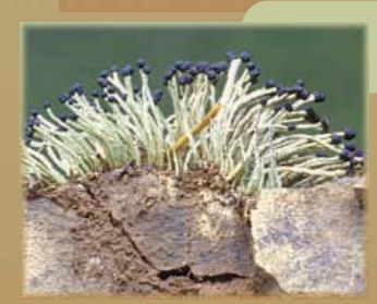
Devil's matchstick Pilophorus acicularis

Lichens are grouped into three categories of shape: foliose (leaf-like), fruticose (shrub-like), and crustose (growing closely attached to a surface).