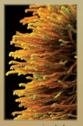
common scissorleaf Herbertus aduncus

Common scissorleaf – A rare liverwort found in forested coastal bogs.