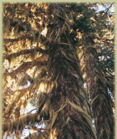
days. common witch's hair Alectoria sarmentosa and Bryoria sp.

Native Americans made the poisonous horsehair lichen edible by steaming it in a pit oven for two days.