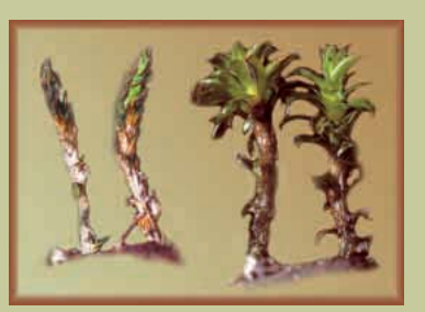
roof screw moss Tortula ruralis

▼ Seemingly lifeless lichens and bryophytes become photosynthetically active within minutes after wetting.