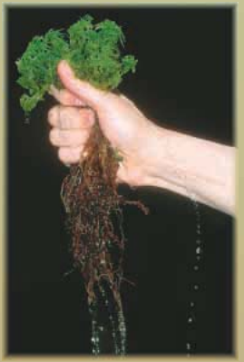
Some bryophytes, such as Sphagnum moss, can hold up to seven times their weight in water.

It has been estimated that lettuce lung provides an average of 3.2 kilograms of nitrogen each year for each hectare of Pacific Northwest forest.