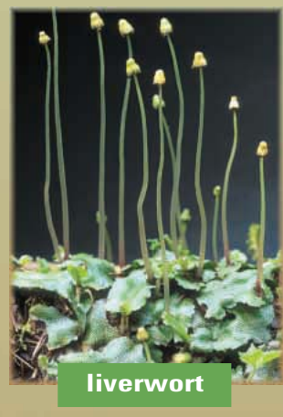
conehead liverwort Conocephalum conicum

Bryophytes are the small green plants commonly known as mosses, liverworts and hornworts. Compared to plants, they have primitive tissues for conducting food and water, and they lack a protective outer surface to maintain water balance. Most bryophytes, because they lack tissues such as roots, obtain their water through direct surface contact with their environment.