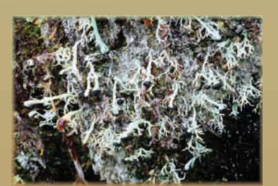
northern fan coral Bunodophoron melanocarpum

▶ Northern fan coral – This lichen was not previously known from the lower 48 states, but is now found in the Olympic National Park.