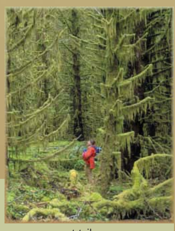
cat-tail moss Isothecium myosuoides