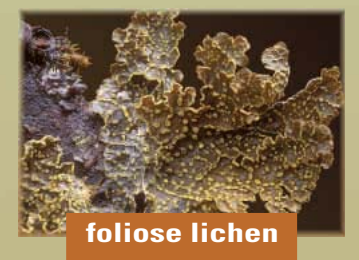
yellow specklebelly Pseudocyphellaria crocata