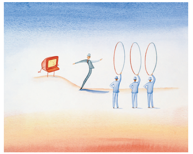
Old computers learn new tricks. Computational tools known as support vector machines discern relevant gene expression data from samples and apply what they learn in order to classify new compounds.

Other approaches to sorting gene expression data for toxicogenomics have included several "unsupervised" methods, in which modeling programs search for patterns within data and generate models of toxicity without being given any hint as to what kinds of expression pat-