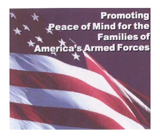
Department of Defense

Office of the Assistant Secretary of Defense (Reserve Affairs) 1500 Defense Pentagon Room 2E185 Washington, DC 20301-1500