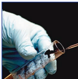
Nanomaterials can behave in unpredictable ways when handled.

Nanomaterials present new challenges to understanding, predicting and managing potential health risks. They may interact with the human body in different ways than more conventional materials, due to their extremely small size. For example, studies have established that the comparatively large surface area of inhaled nanoparticles can increase their toxicity. Such small particles can penetrate deep into the lungs and may move to other parts of the body, including the liver and brain.