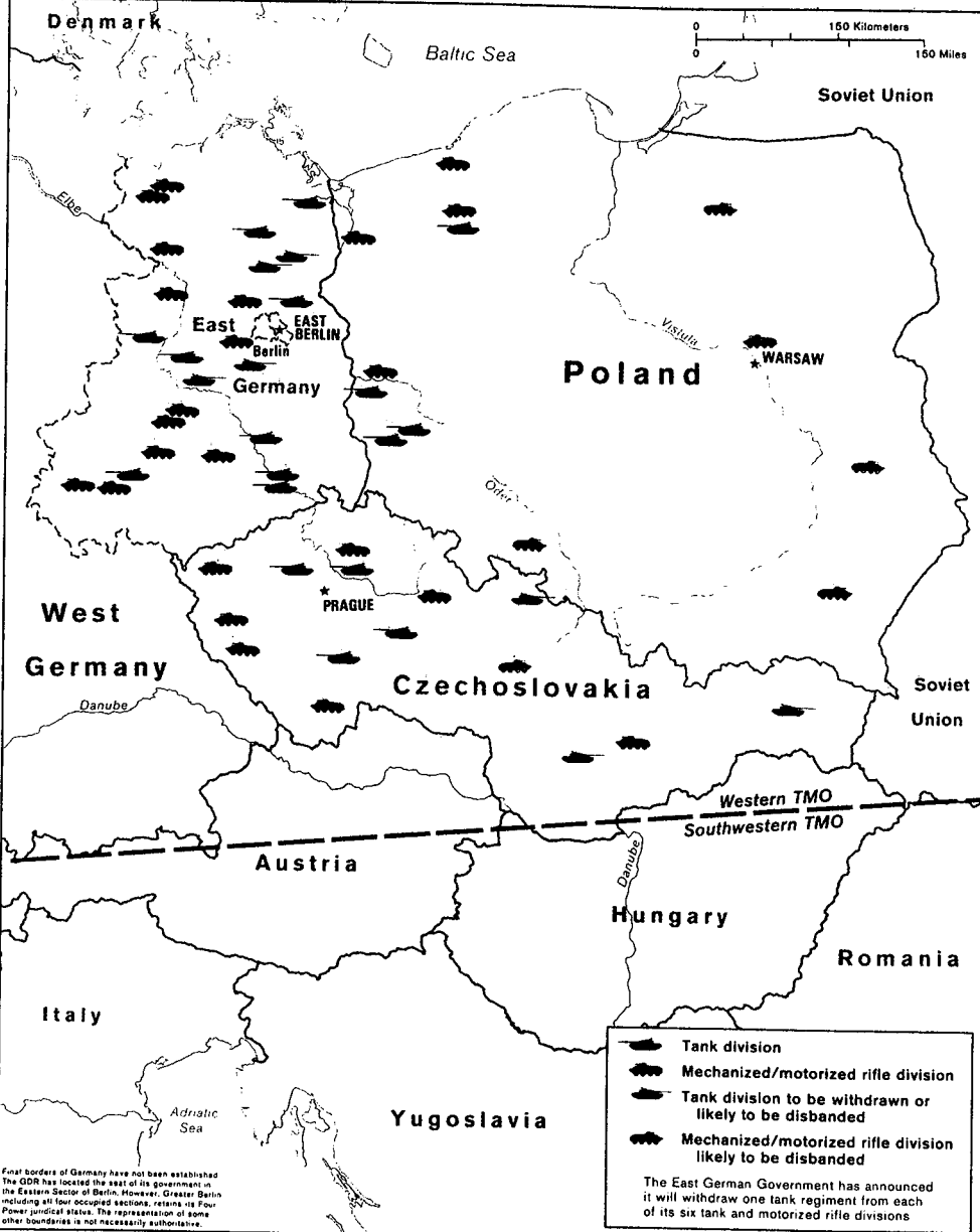
Figure 2 Announced Warsaw Pact Unilateral Force Reductions in the Western Theater of Military Operations