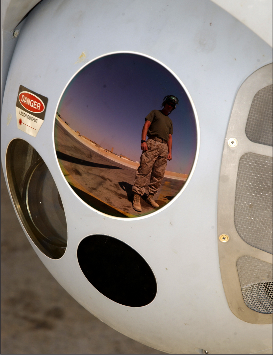
Mounted just under the nose of one of Marine Light Attack Helicopter Squadron 169's UH-1N Huey helicopters at Al Asad, Iraq, the BRITE Star thermal imaging and laser designation system allows the UH-1N to support a variety of imaging and targeting missions.

"The biggest advantage of the BRITE Star is its capability to laser designate for Hellfire missiles which greatly helps us accomplish our mission," said Reed.