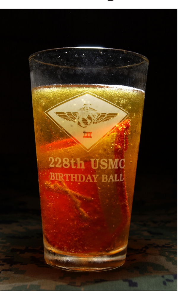
Don't drink and drive!

For more information on how you can stay safe during the ball season, contact your unit's Arrive Alive coordinator or SACO.