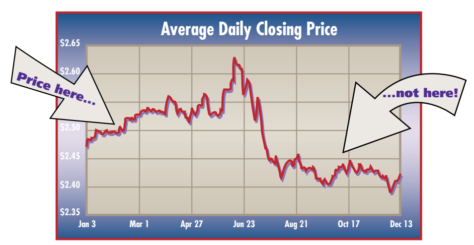
The best marketing opportunities normally occur before harvest.

Although most farmers still prefer to buy options through a broker, these option-derived cash contracts have carved out a niche.