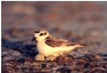
Snowy Plover

You are requested to report sightings of birds not on our check-list or if listed as rare or accidental. Sightings may be reported to the Refuge Manager, Salt Plains National Wildlife Refuge, Rt. 1, Box 76, Jet, OK 73749.