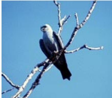
(Above) Mississippi Kite.

Please Reuse or Return at Visitor Center