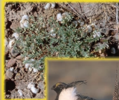
Astragalus purshii (woolypod milkvetch)