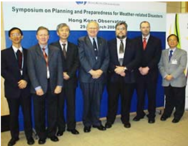
Symposium on Planning and Preparedness for Weather-Related Disasters in Hong Kong.

Education Coalition, NWS Lightning Safety Awareness Week, and other NWS outreach initiatives.