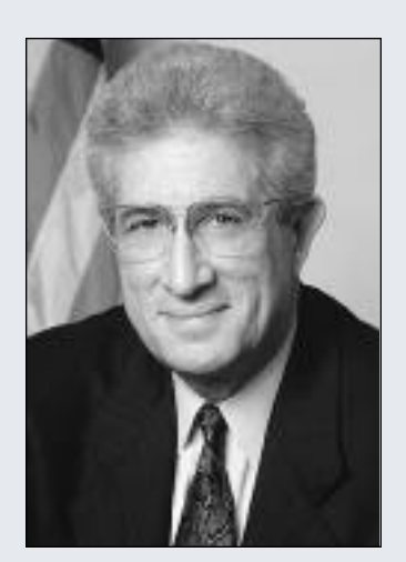
Richard H. Solomon

n October 1984, just fifteen years ago this month, Congress enacted legislation establishing the United States Institute of Peace. Its charter reflected the strivings of a national campaign for an institution dedicated to educating peacemakers. Congress directed us to serve the American people through policy research, education, and training on ways of promoting international peace and resolving conflicts without recourse to violence. Today, the Institute is thriving in its "teen" years, growing into its mandate, steadily building its public identity as a national center of education and professional training in the skills of international conflict management.