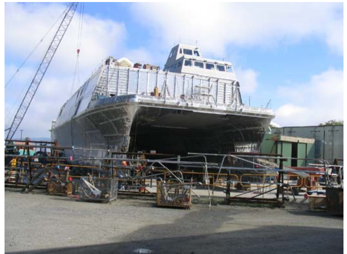
Construction progress (Sep '04)

X-Craft will provide a platform for the evaluation of minimum manning concepts on future naval surface ships. A base crew of 26 (Navy and U.S. Coast Guard) personnel will be responsible for all operations and basic maintenance, requiring a significant shift in the normal levels of manning currently used to accomplish various missions and tasks. X-Craft also will be among the first U.S. Navy ships to employ “paperless” navigation through the use of the Sperry Marine Electronic Charting and Display Information System (ECDIS) and Voyage Management System (VMS). Typically, the ship will operate with just three watchstanders and one roving patrol to monitor and configure engineering systems. This reduced manning will be supported by a level of automation and sophisticated monitoring of systems and equipment previously absent on U.S. Navy ships.