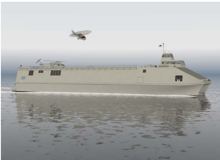
Conceptual drawing of X-Craft during flight operation

X-Craft is designed as a “sea frame,” that is, a ship that is capable of performing many missions. X-Craft will be the Navy's first sea frame that decouples hull, mechanical and electrical (HM&E) systems