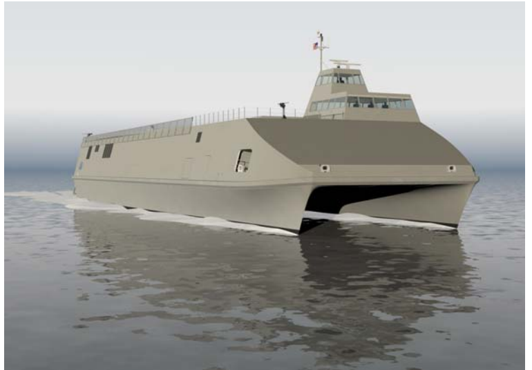
Conceptual drawing of X-Craft

X-Craft's unique hull form combines the stability of a catamaran with the power of a combined diesel or gas turbine (CODOG) engine plant. Two MTU 595 diesel engines will supply power for cruising speeds while two General Electric LM2500 gas turbines will allow sprint speeds greater than 50 knots in calm seas. With active ride control actuators forward and aft, the vessel will be capable of maintaining 40 knots or more in Sea State 4 (2.5 meter waves). Four steerable Kamewa water jets will provide propulsion and maneuverability. X-Craft will have an unrefueled range of more than 4,000 nautical miles, allowing it to make independent trans-oceanic voyages. An installed “science package” of strain gauges, accelerometers, pressure gauges, and underwater viewing windows will provide valuable data on the performance of the hull structure in high sea states. Internal communications will be provided by personal communication system (PCS) wireless technology, eliminating the need to rely on hard-wired telephone systems.