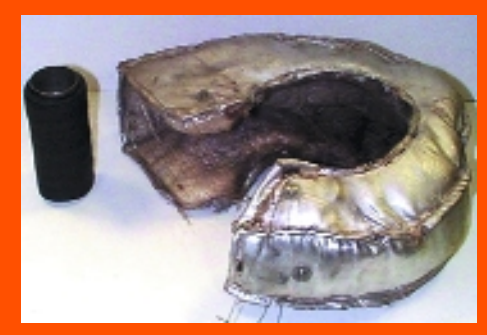
The blanket, pictured on the right, has been replaced with a new technology bonded thermal wrap (left.) The Marine Corps' LAVs are being retrofitted with the new wrap on seven existing motor parts.