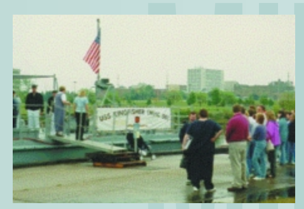
Employees of the Defense Logistics Information Service await their chance to tour the USS Kingfisher during its port call in Muskegon, Mich.

The Defense Logistics Agency is a leading logistics information broker for the Department of