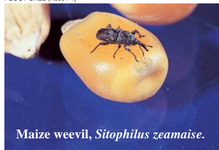
Maize weevil, Sitophilus zeamais .

biopesticide. That means beneficial insects and others that don't feed on the crop would not be affected. Groundwater, too, is protected from contamination because avidin is a biodegradable protein.