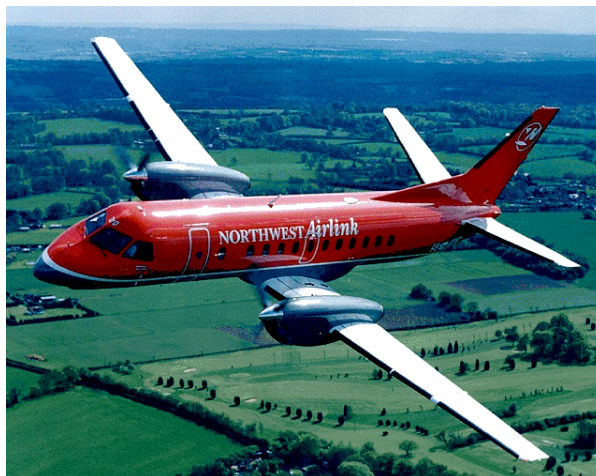
Figure 1. A Saab 340 aircraft operated by Mesaba Airlines.