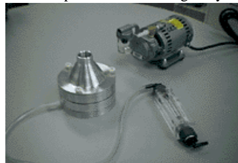
Anderson N-6 Viable Bioaerosol Sampler

Immediate remediation actions included: hiring a dedicated HVAC repair mechanic to regularly access all areas needing preventive maintenance, replacement of HVAC air filters, cleaning of accessible HVAC components with a water and bleach solution, and repair of HVAC system mechanical components. The purchase of the specialized Anderson air sampler allowed the Rota Industrial Hygiene Department to conduct follow-up sampling for fungal contamination after each major abatement measure. The air samples were forwarded to LT Buffington at EPMU-2 to analyze for fungi. Repeat air sampling revealed a significant drop in airborne fungal colonies of up to 97% by the end of the abatement project.