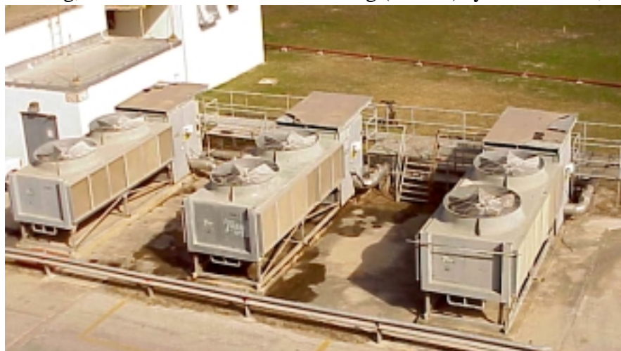
Existing HVAC chiller units (being replaced under currently funded contract) are representative of the age of the majority of the facility's HVAC systems.

Working together, they quickly learned that contractors and base maintenance personnel had not always had regular access to provide periodic preventive maintenance (PM) on the building's Heating, Ventilation and Air Conditioning (HVAC) system. In fact, no one was really certain when