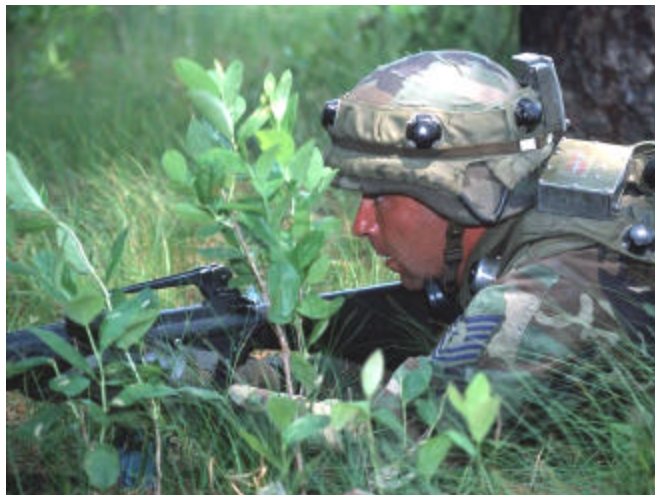
Exercise combatant lies prone in the grass aiming his M16 Rifle downrange during a readiness competition.