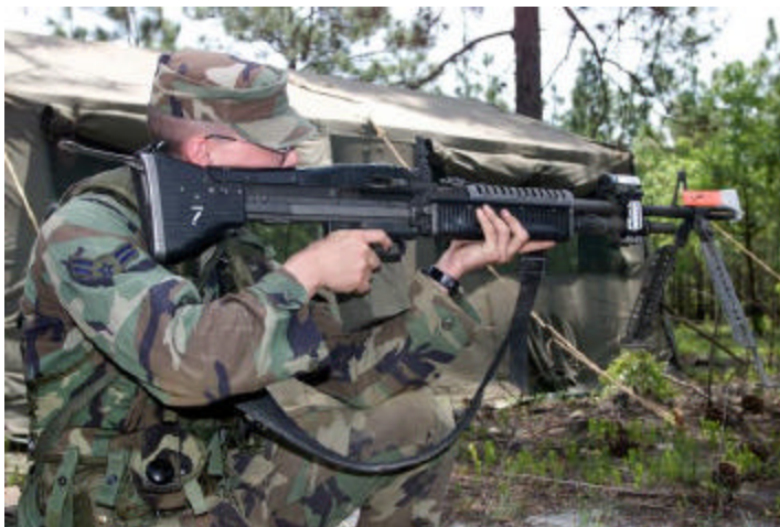
Using safe weapon-mounted laser system during readiness competition.

The Naval Surface Warfare Center, Crane, Indiana requested in October 2000 that NSWCDD evaluate the SIMLAS+ laser system to assess the