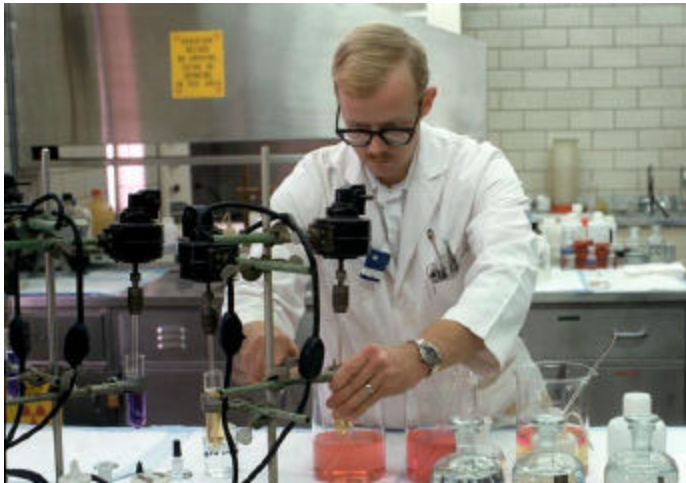
Researchers often work with chemicals that may emit airborne contaminants

Industrial hygiene is a scientific specialty that is dedicated to the prevention of occupational diseases and injuries through anticipation, recognition, evaluation, and control of exposure to chemical and physical hazards in the workplace.