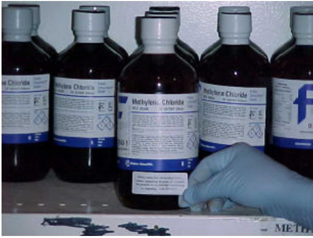
Self-sticking label serves as reminder to call the Industrial Hygiene Office for monitoring

hygiene monitoring prior to their use. As an example, the Chemistry Division at NRL has approximately 8,000 different chemicals in its inventory.