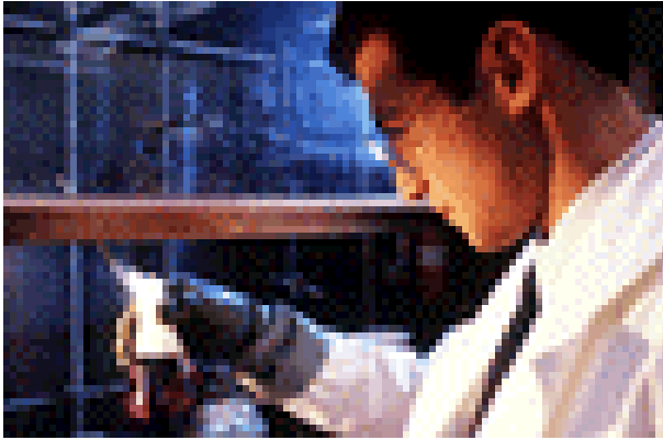
Timing of laboratory experiments can be unpredictable

Monitoring for airborne contaminants at R&D laboratories that the