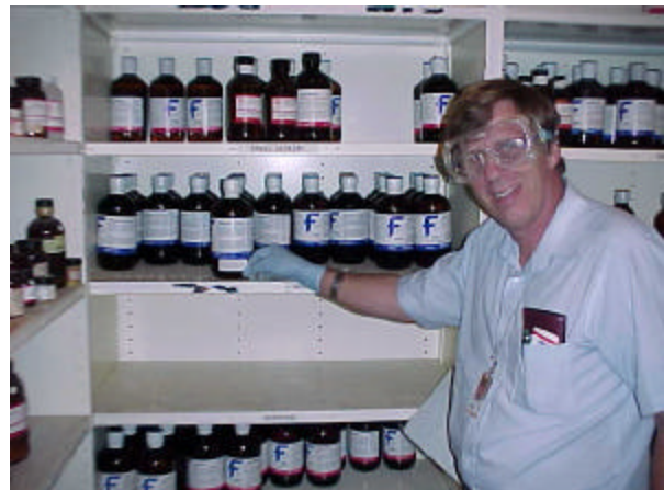
Numerous potentially hazardous chemicals are stored at R&D laboratories that may require analysis by an industrial hygienist

Some of the hazardous substances used in research and development (R&D) laboratories are regulated by the Occupational Safety and Health Administration (OSHA) or by Navy standards. In those cases, an industrial hygienist collects samples of air in the worker's breathing zone during the use of particular hazardous substances to determine, through chemical analyses, the concentration of the hazardous substances that the employee might breathe. There are also other health-hazardous substances, not yet specifically regulated by OSHA, which may cause cancer or birth