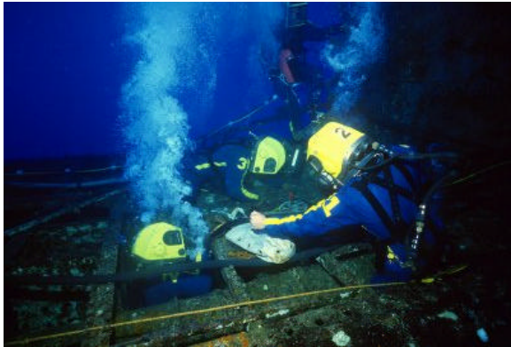
NSC's many publications, such as Diving Safetylines , bring safety information to the fleet

job. The NSC staff also investigates Navy and Marine Corps mishaps anywhere in the world and collects, maintains, and distributes mishap information to the fleet to help prevent future mishaps. To keep abreast of mishap trends, safety practices, and new developments in mishap prevention, NSC also works with international militaries, governments, and industrial-safety organizations.