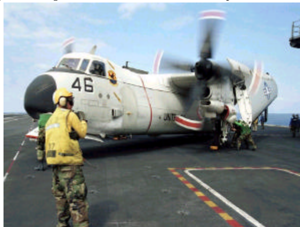
Aircraft director supervises safety tie down of a C-2 Greyhound aircraft on flight deck of USS Theodore Roosevelt

Through the above-mentioned NSC programs, publications and analyses, the military and civilian staff members at the Naval Safety Center have seen their efforts to reduce mishaps pay off. NSC aviation safety programs such as angled decks, Naval Aviation Maintenance Program, squadron-safety program, system-safety designed aircraft, aircrew training, and operational risk management have decreased the number of Navy and Marine aircraft destroyed in non-combat related mishaps from 776 in 1954 to 15 in 2001. So far, 2001 was the safest year in the U. S. Navy's aviation history, well on the way to our goal of reducing losses to zero.