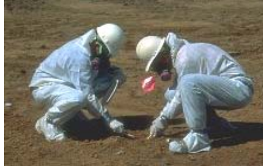
Workers wearing air-purifying respirators (air exposures are known to be minimal) take soil samples.

Hazardous waste cleanup sites must be properly managed to ensure they do not harm populations now and well into the future.