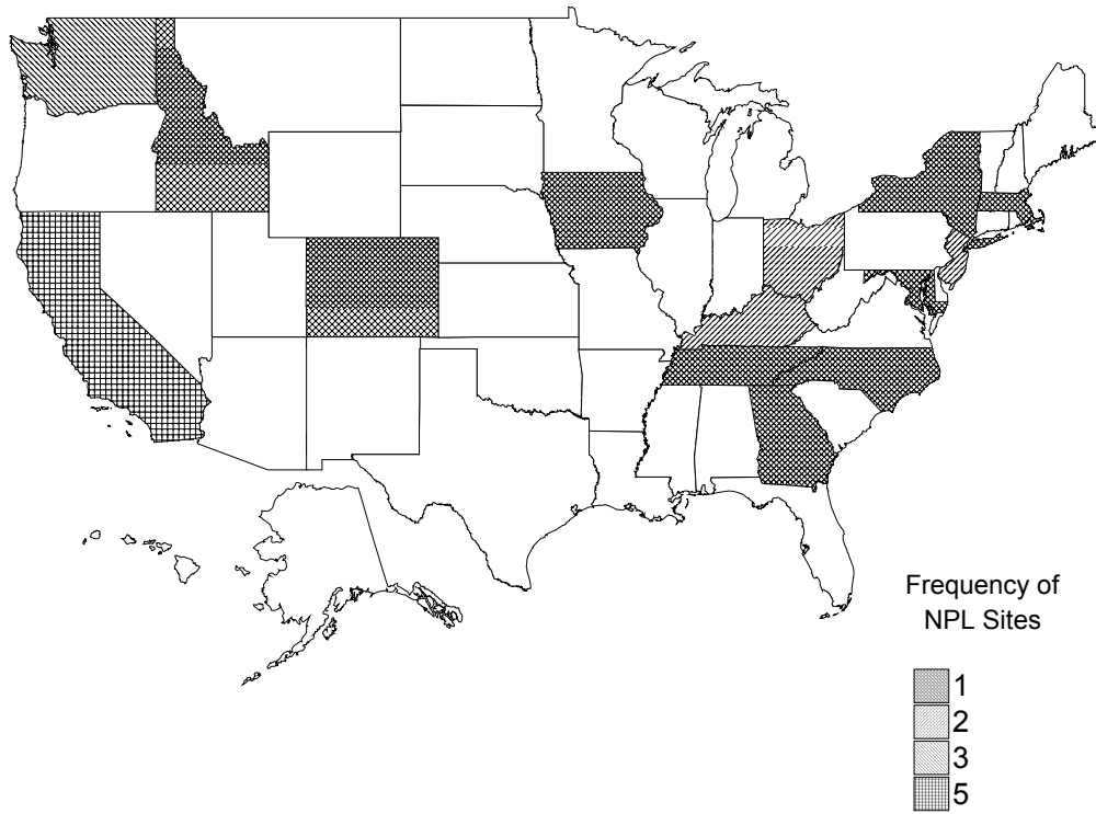
Figure 6-3. Frequency of NPL Sites with 137 Cs Contamination