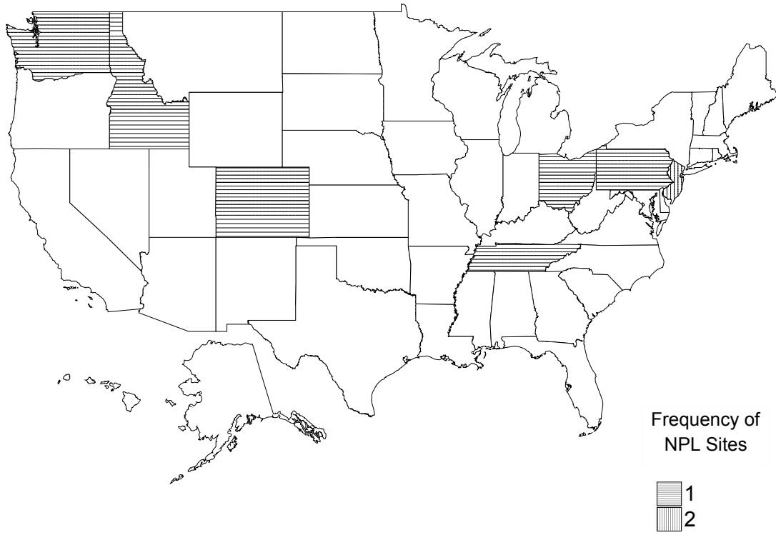
Figure 6-1. Frequency of NPL Sites with Cesium Contamination