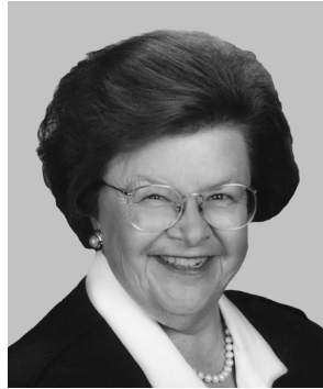
Sen. Barbara A. Mikulski of Baltimore Democrat—Jan. 3, 1987