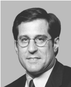
Steven R. Rothman of Fair Lawn (9th District) Democrat—4th term