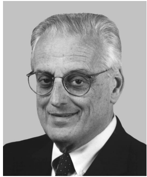
Bill Pascrell, Jr. of Paterson (8th District) Democrat—4th term