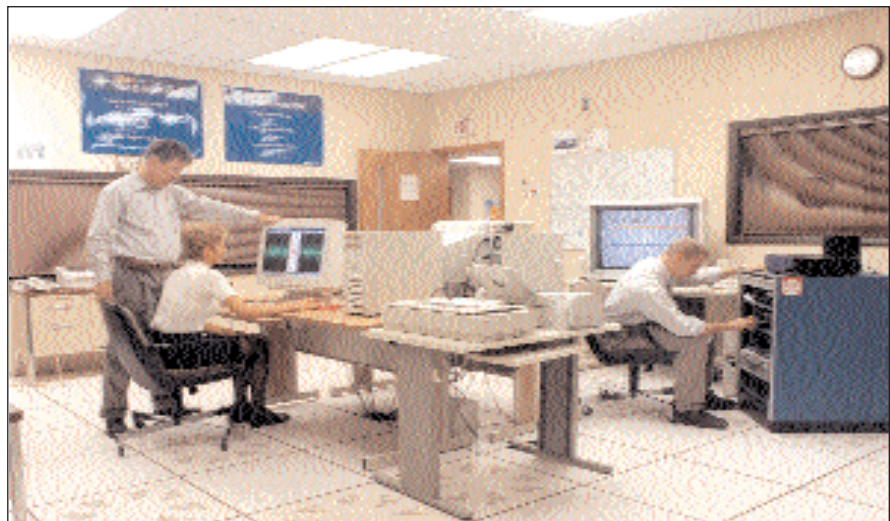
LEAF staff use advanced software to analyze an audio recording.

(pops and clicks), tonal (persistent tones) and wideband (static) corruption. Input signals are processed in real time, with a maximum system delay of only 300 milliseconds. SMART technology also is useful in recording interviews when accuracy is critical in a setting with poor acoustics.