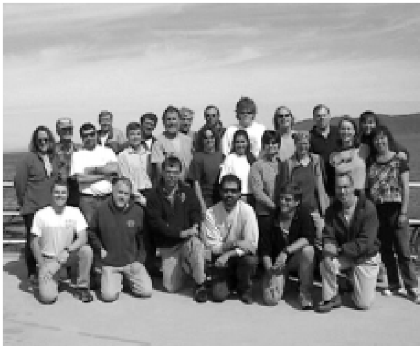
The Newport, Oregon based Astoria Canyon Research Team.

A team of scientists, led by the NWFSC and the Pacific Marine Environmental Laboratory, began mapping the undersea phenomenon of Astoria Canyon, 10 miles west of the Columbia River's mouth, to document its physical and biological characteristics. Scientists from NOAA's Southwest Fisheries Science Center and the Olympic Coast National Marine Sanctuary, Oregon State University, Washington State University, the University of British Columbia, the California Department of Fish and Game, curators from the Los Angeles County Museum, and the public aquarium and outreach center of OSU's Hatfield Marine Science Center participated in the project. This study will yield extensive data about the characteristics of an essentially untouched ocean ecosystem and allow scientists to test assumptions about how human impacts contribute to sea floor deterioration.