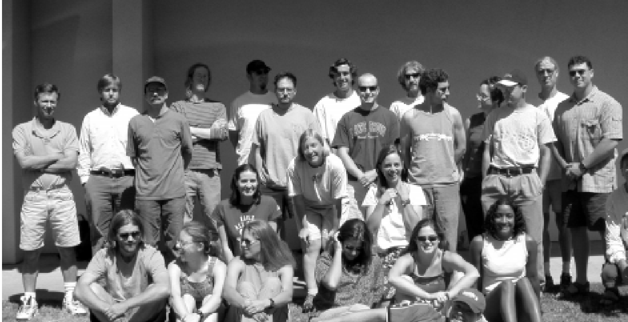
The 2001 Observer class.