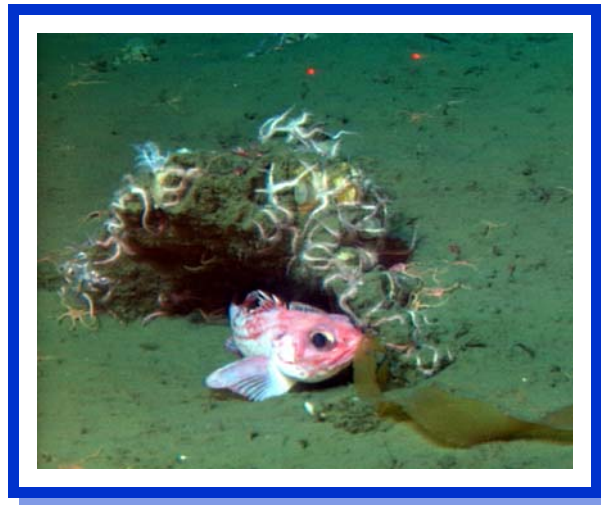
Thornyhead rockfish hides under rock covered with brittle stars.

and concluded that a new research facility was needed and that this facility should be 15,000 sq. ft. and con-