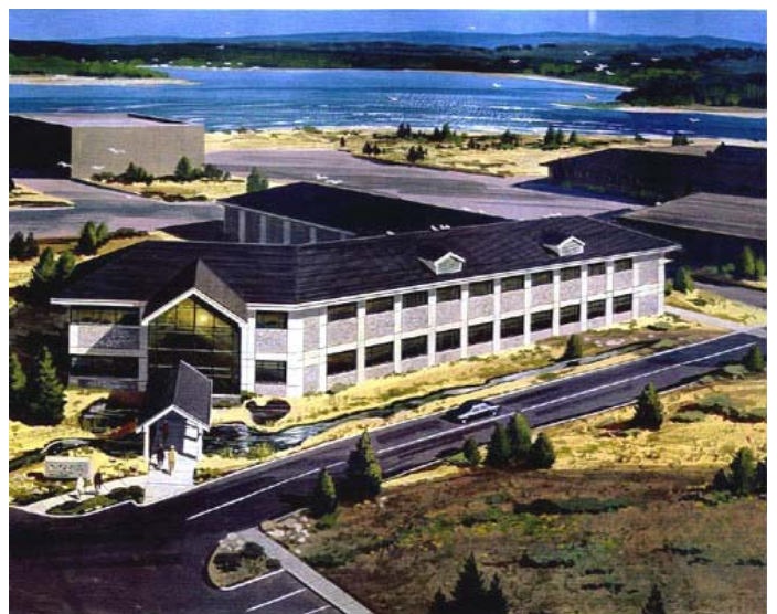
May 2001 Rendering of the Barry Fisher Building, Newport, OR.

men – in our renewed efforts to rebuild the groundfish population. Collaboration is the key to our future success."