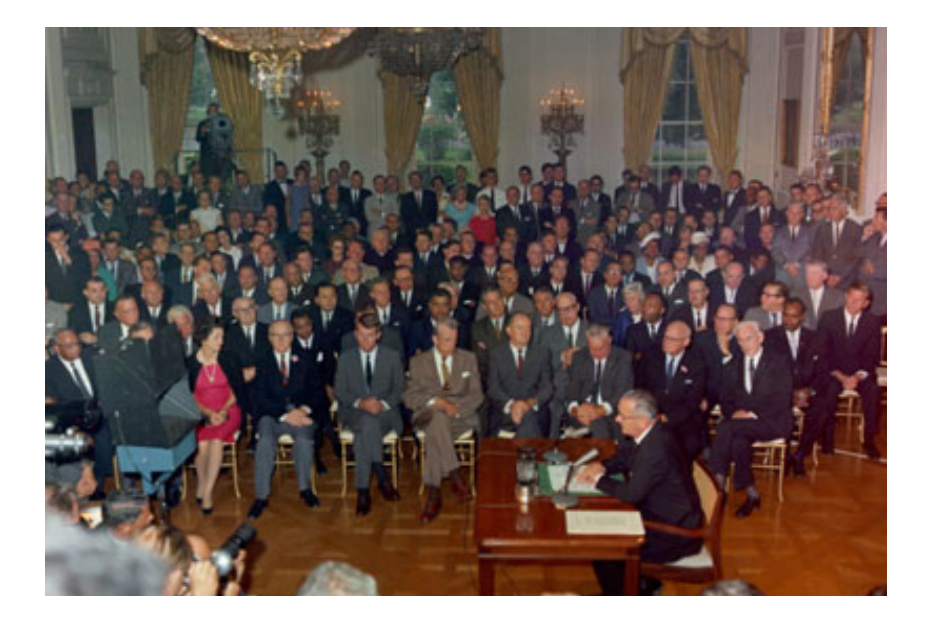
President Lyndon B. Johnson signs the Civil Rights Act of 1964, July 2, 1964

July 2, 2004, marked the 40<sup>th</sup> anniversary of the signing of the Civil Rights Act of 1964 and Title VI. Title VII prohibits discrimination in employment on the bases of race, color, national origin, religion, and sex.