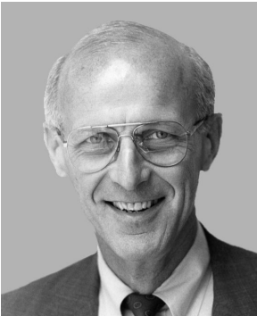
John W. Olver of Amherst (1st District) Democrat—7th term