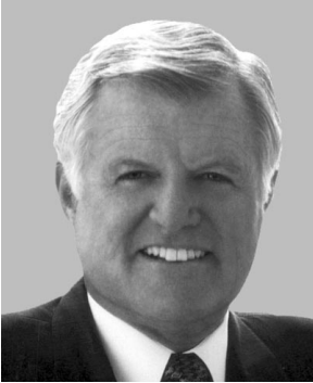
Sen. Edward M. Kennedy of Barnstable Democrat—Nov. 7, 1962