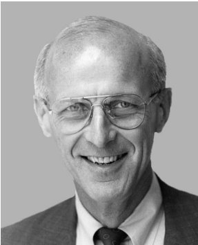
John W. Olver of Amherst (1st District) Democrat—7th term