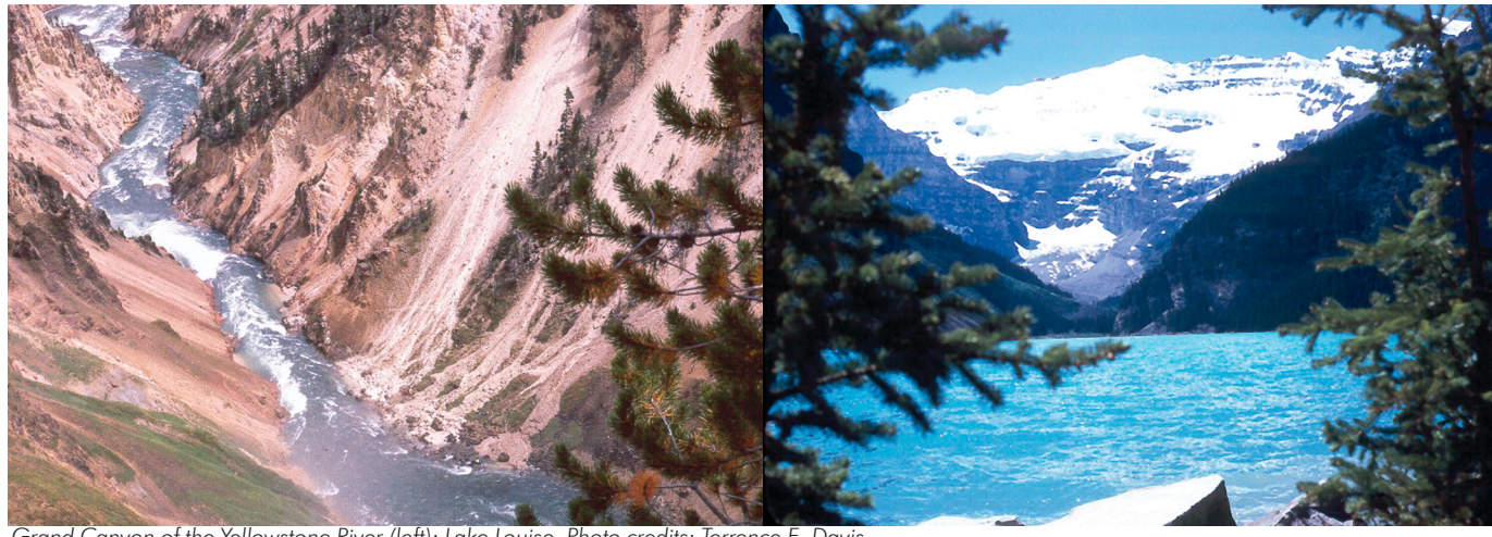
Grand Canyon of the Yellowstone River (left); Lake Louise.