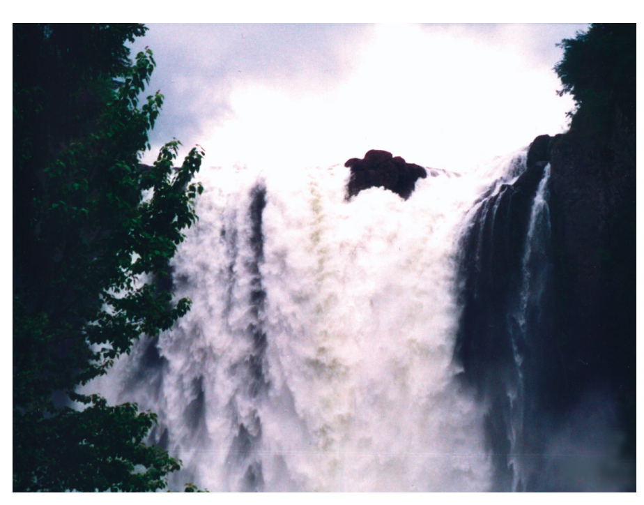
Snoqualmie Falls.

Award of the President of the United States on the validity of the treaty of limits of 15 April 1858 between Costa Rica and Nicaragua