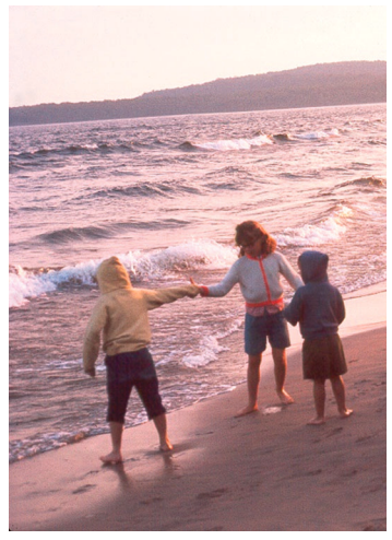
Temperance River (left); Lake Superior.