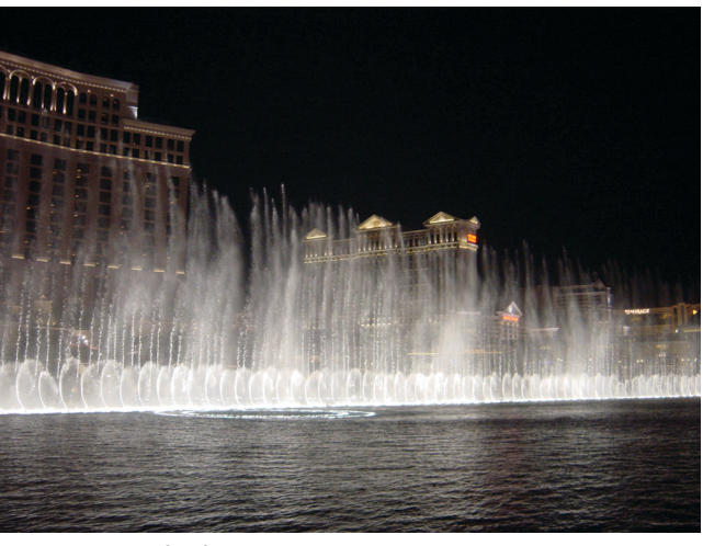
Hoover Dam, Colorado River (left) ; fountains, Las Vegas.