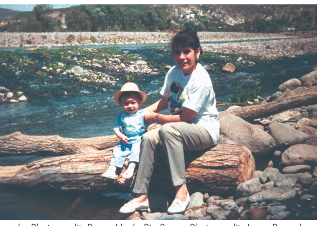
Rio Grande. Rio Bravo.