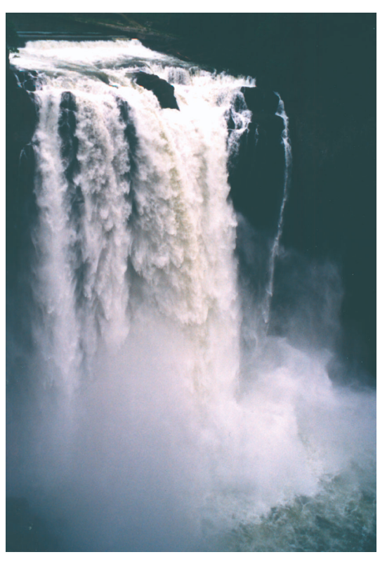
Snoqualmie Falls.

January 11, 1909 Lake Erie, Lake Great Britain; Treaty Between Great Britain and the United States Michigan, Milk, United States of relating to boundary waters and boundary questions Niagara, St. Mary America