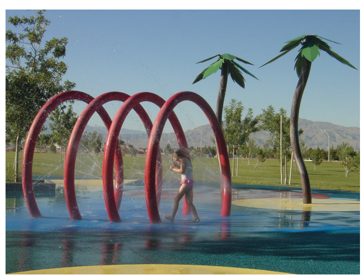
Water park, Colorado River Basin.

Agreement between the United Mexican States and the Republic of Guatemala on the protection and improvement of the environment in the border area