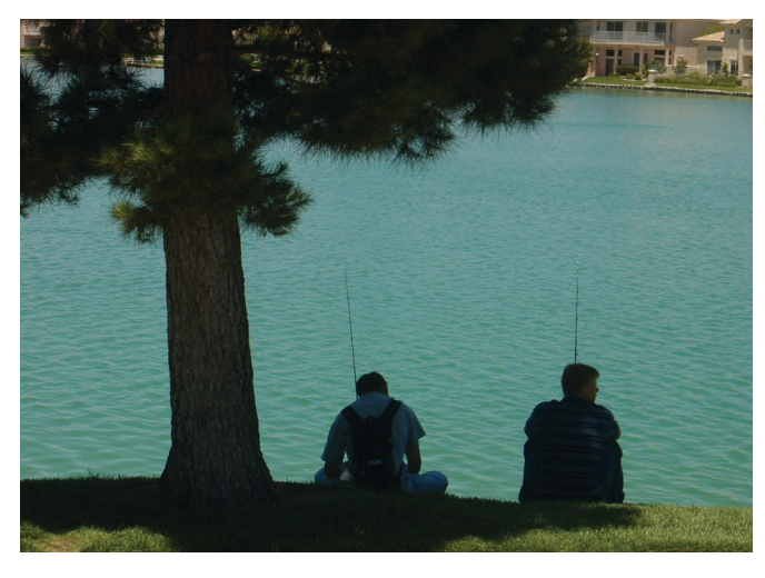
Fishing, artificial lake, Colorado River basin.