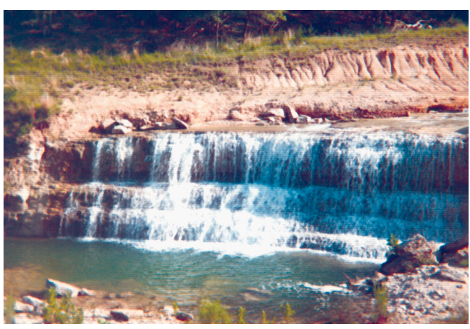
Rio Bravo tributary (left). Rio Grande tributary.