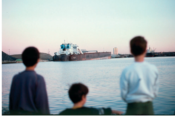
Lake Michigan (left). St. Lawrence River at Québec.