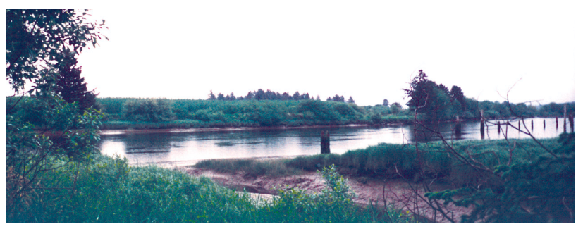
Lower Columbia slough; Oregon swimmers (right).