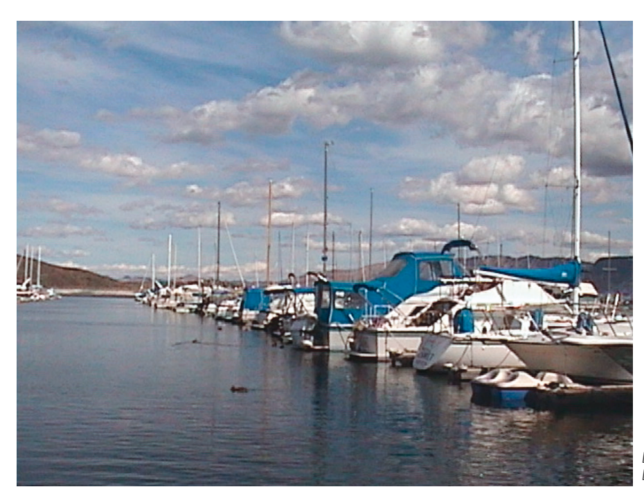
Lake Mead.