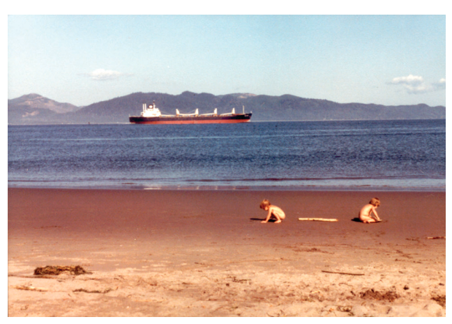
Irrigation canal, Columbia Valley. Columbia River.