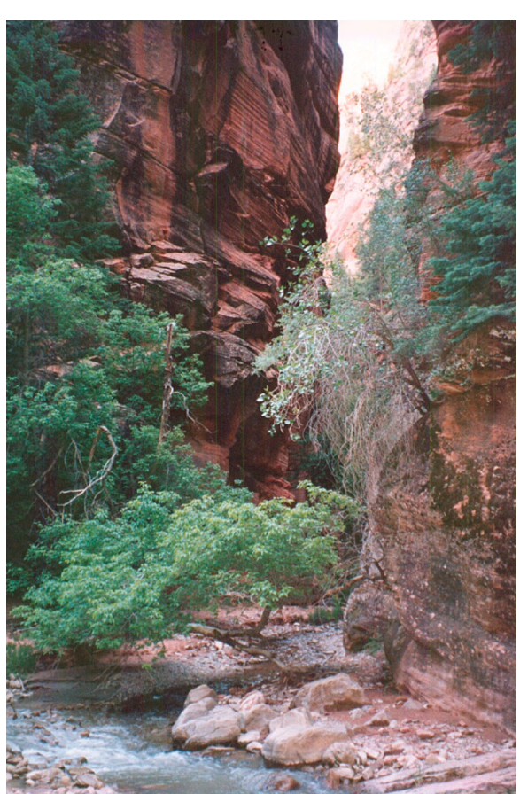
Zion Canyon creek.

Treaty for the delimitation of the boundary between Guatemala and El Salvador