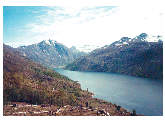
Lake, Mount St. Helens. Wenatchee River rapids.

Treaty between Great Britain and the United States United States of relating to boundary waters and boundary questions