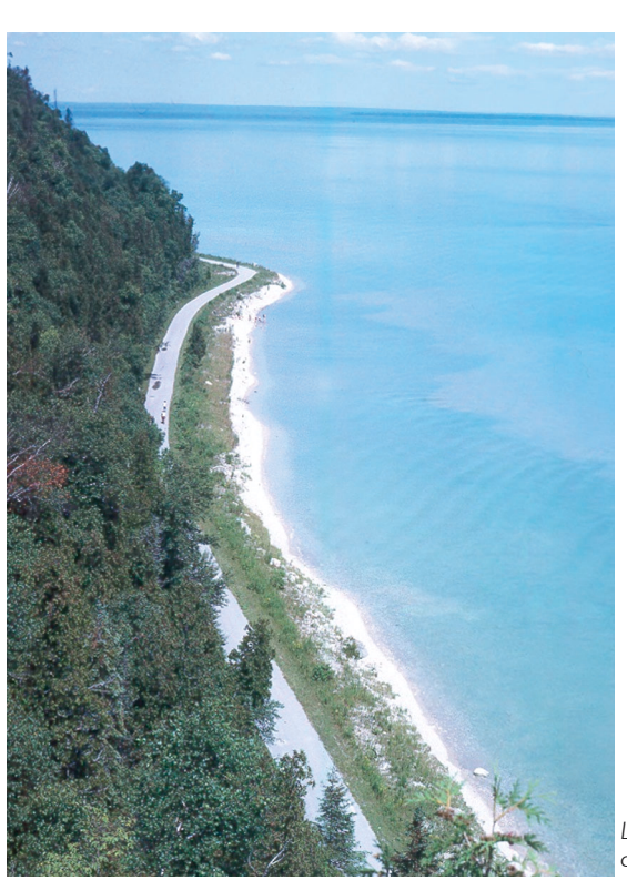
Lake Michigan.

Treaty of peace, of friendship and of arbitration between the Dominican Republic and the Republic of Haiti, signed at Saint-Domingue