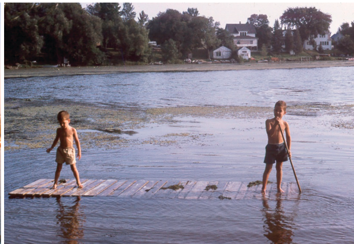
Mississippi River (left). Little Muskego Lake.