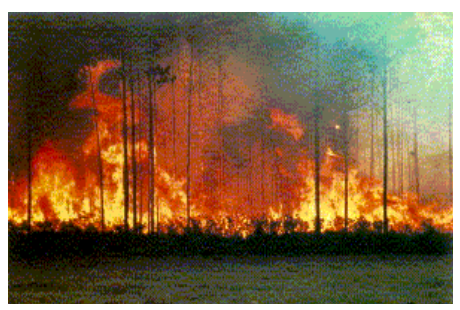
Research on the effects of prescribed fires on the Florida Panther National Refuge.

Research on wildlife species at the Leetown Science Center is directed toward Federal trust species (such as threatened and endangered wildlife) and the management of federal lands. For example, the U.S. Fish and Wildlife Service needed to evaluate the effects of prescribed fire on Florida panthers in south Florida. Center scientists determined that prescribed burning in pine stands benefited these endangered cats by attracting deer and wild hogs which, in turn, were attracted by new herbaceous growth and acorns exposed by burning. Since most of the benefits were within 1 year following fire, officials are considering shortening burning