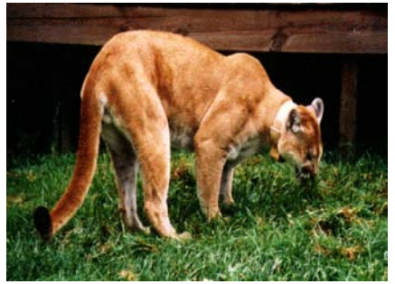
Investigations of trust species, such as the Florida panther, assist resource management.

Fragmentation of habitats and populations is a major concern for many wildlife species. Center scientists are addressing this issue in their studies involving black bear populations in the southeastern U.S. Research in south Alabama suggests that the removal of den trees, along with prolonged flooding for water