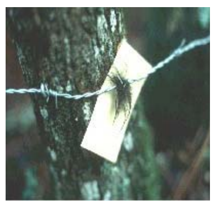
Bear hair used for DNA fingerprinting

control, has resulted in a significant loss in denning habitat. To determine the size of populations at Tensas River National Wildlife Refuge, bears are being censused using DNA extracted from hair "snagged" at barbed wire bait sites. Animals can be uniquely identified using molecular techniques and accurate mark-recapture population estimates can be made. Scientists at the Center have also developed techniques for reintroducing bears into vacated habitats by translocating females with cubs during winter. These hibernating bears are moved from their natural den sites to new den sites at the release area. The technique has been shown to greatly increase survival and keep the released bears at the new site. In another study to assist management, bear population ecology is being compared before and after construction of a major highway through prime bear habitat in coastal