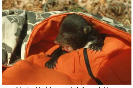
Moving black bears to their former habitats

Wildlife research conducted by scientists at the Leetown Science Center helps client bureaus to better manage federal lands and trust species by making objective, sciencebased decisions.