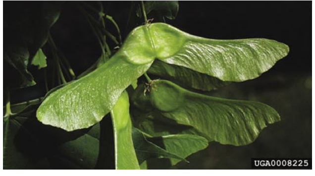
Acer platanoides L.