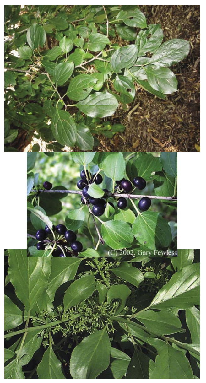
Rhamnus cathartica L.