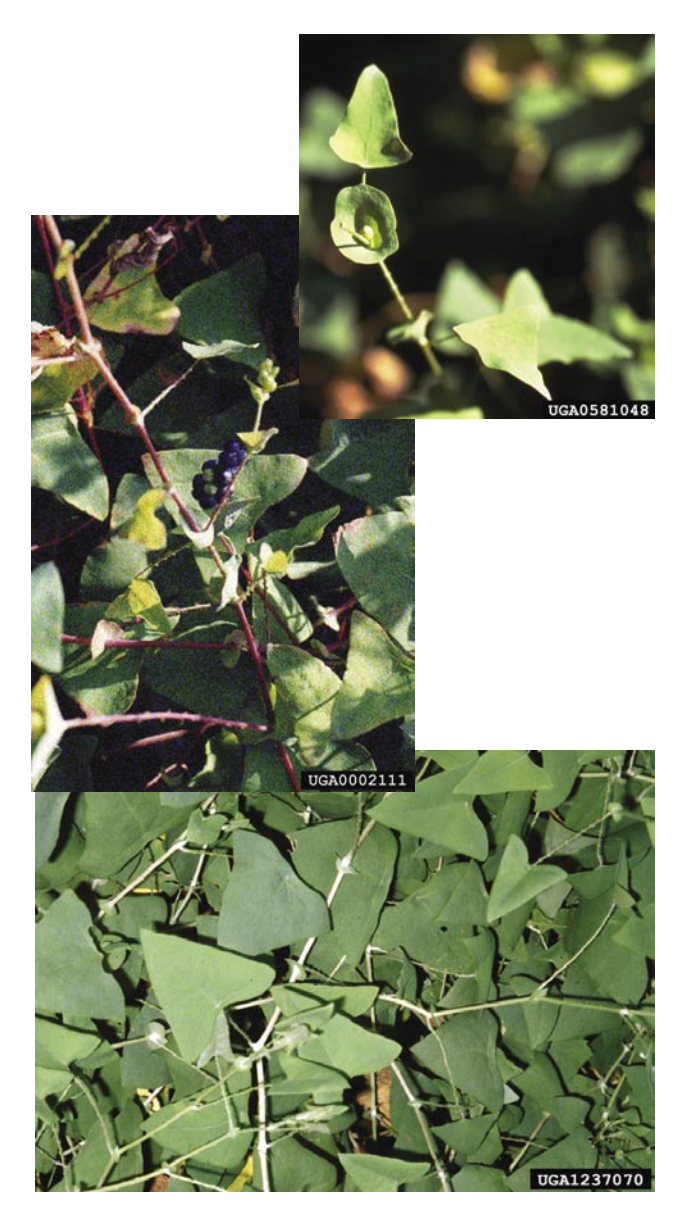
Polygonum perfoliatum L.