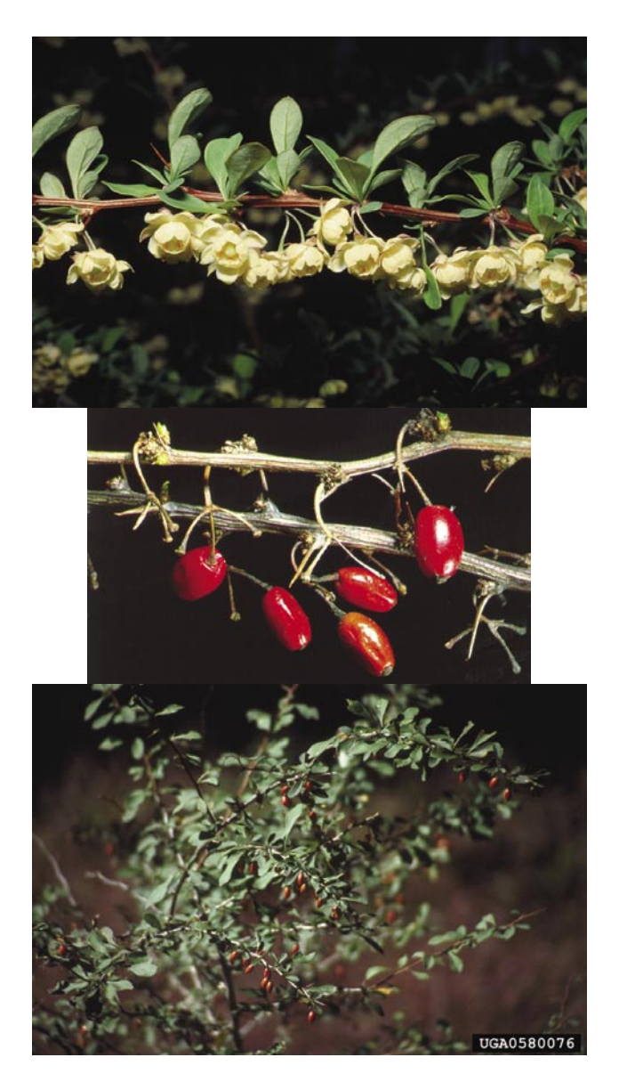
Berberis thunbergii DC.