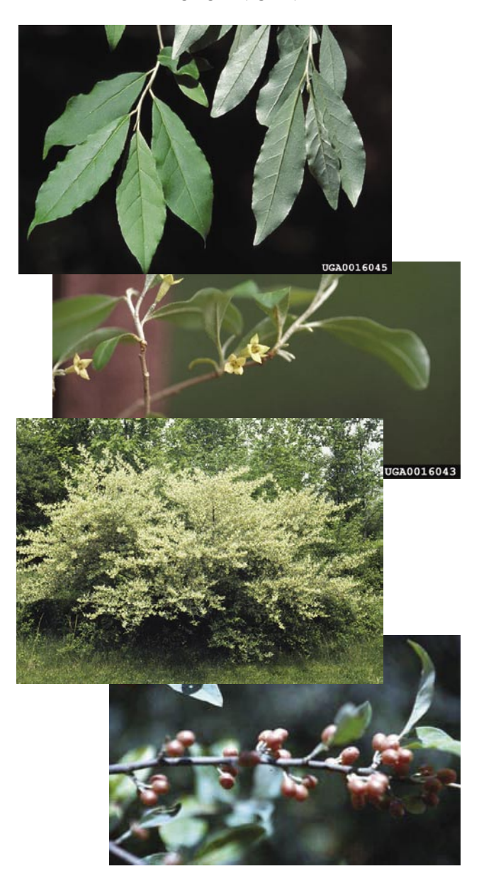
Elaeagnus umbellata Thunb.