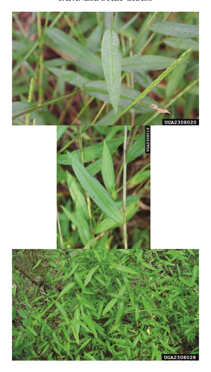
Microstegium vimineum (Trin.) A. Camus