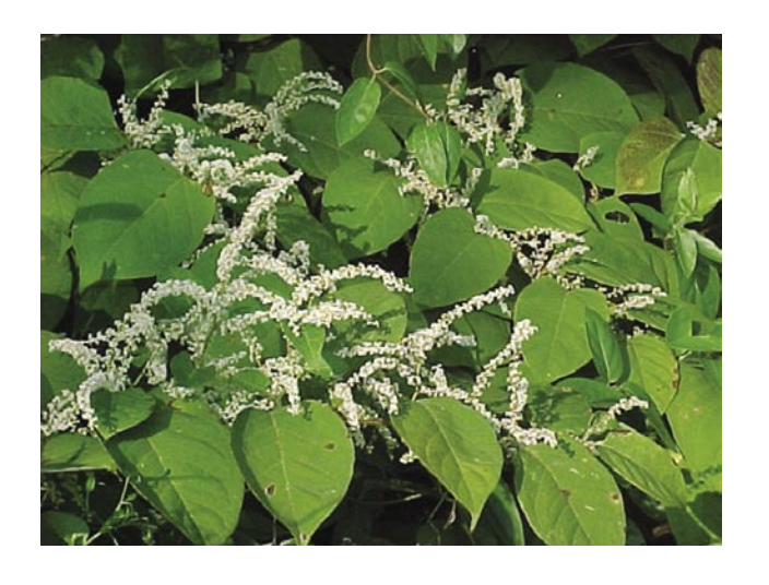
Fallopia japonica (Houtt.) Ronse Decraene