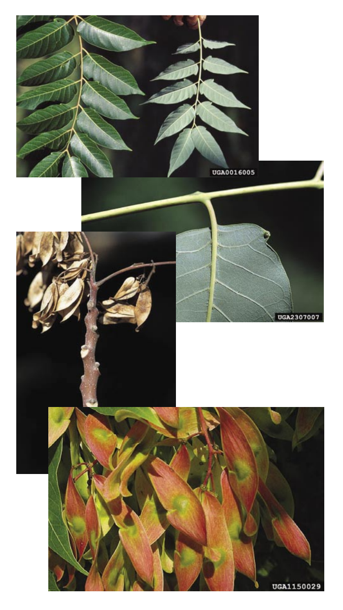
Ailanthus altissima (Mill.) Swingle