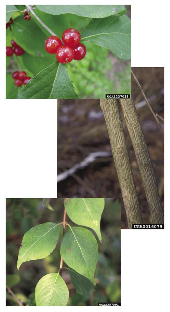
Lonicera maackii (Rupr.) Herder