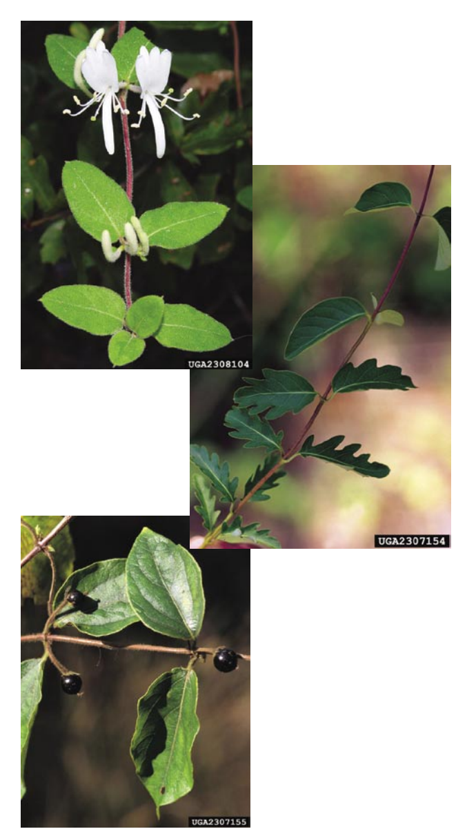
Lonicera japonica Thunb.