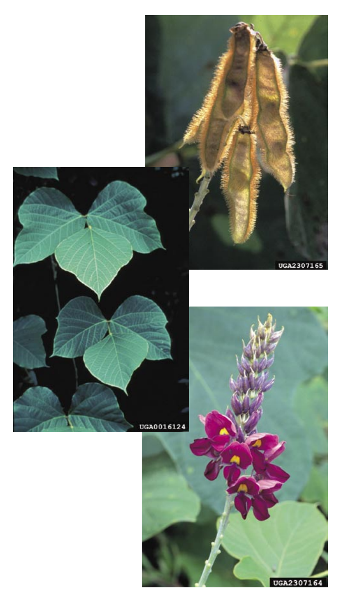
Pueraria montana (Lour.) Merr. var. lobata (Willd.) Maesen & Almeida