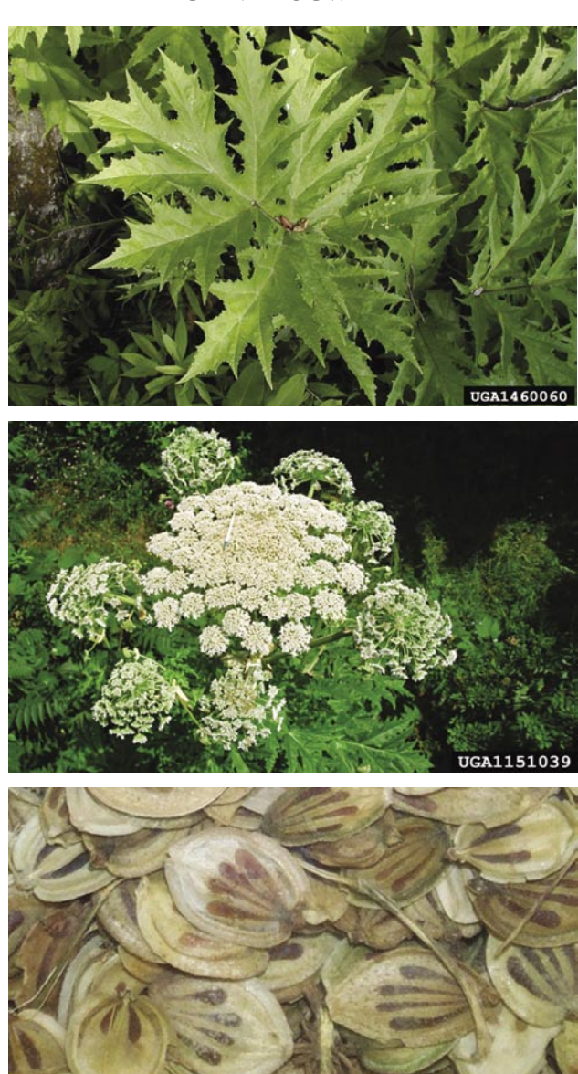
Heracleum mantegazzianum Sommier & Levier.