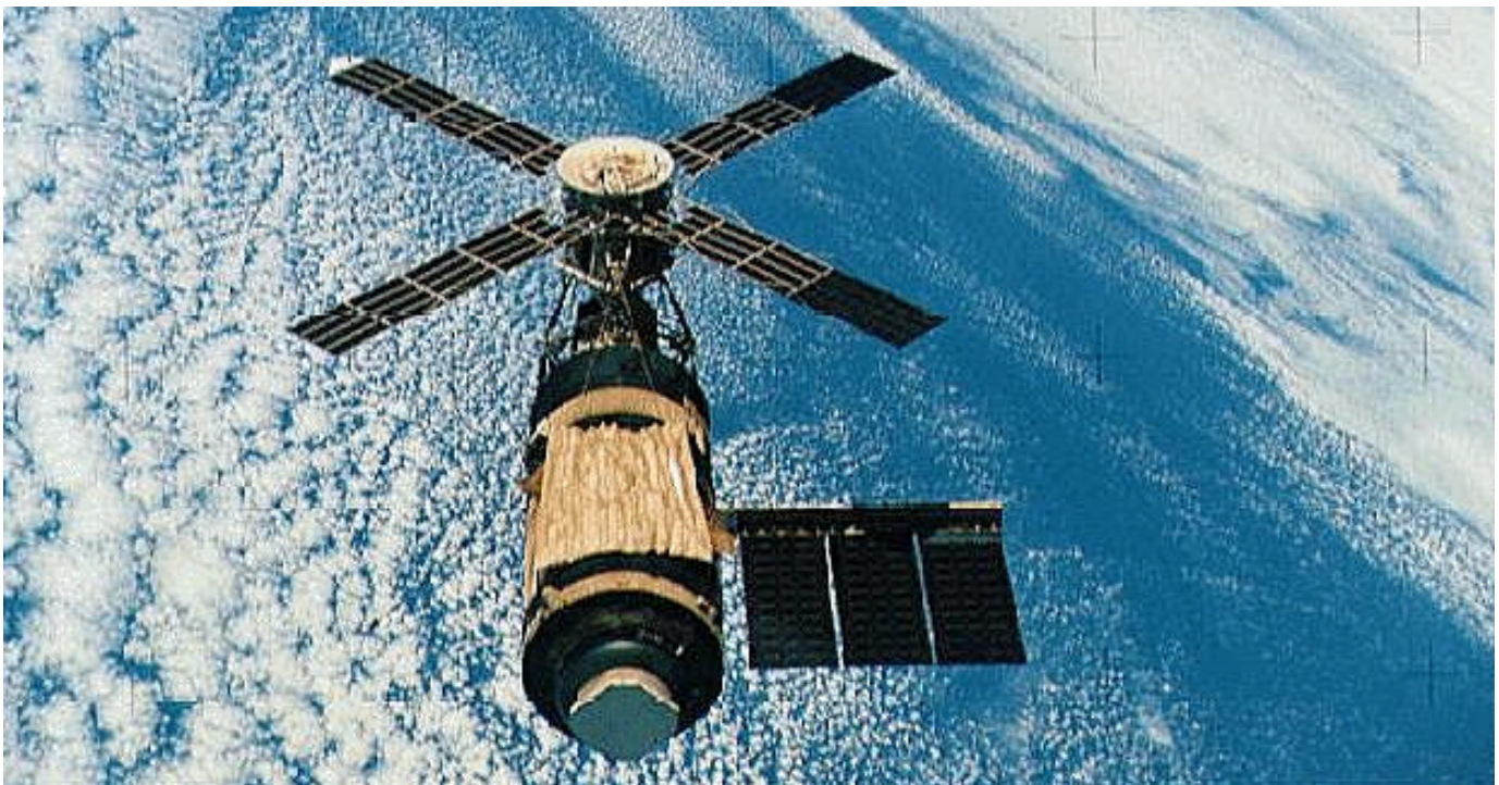
The first U.S. space station, Skylab, seen as its final mission approached in 1974

In 1926, American Robert Goddard made a major breakthrough by launching the first liquid-fueled rocket, setting the stage for the large, powerful rockets needed to