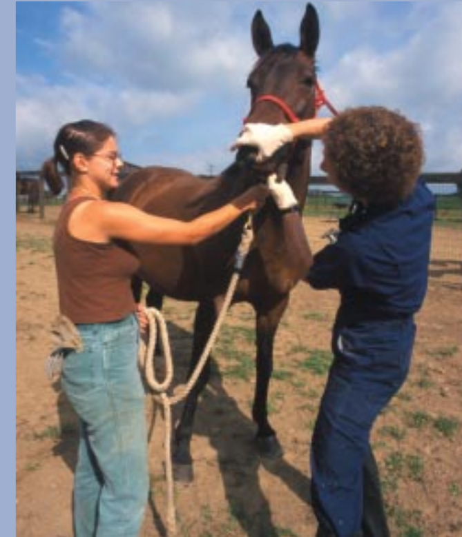
Wilson scholarship students do hands-on, paid work for APHIS during summer and holiday periods and have the opportunity for full-time employment after receiving their terminal degree.