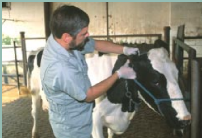
VS supports the livestock industry in the prevention and control of animal diseases that could otherwise be devastating.