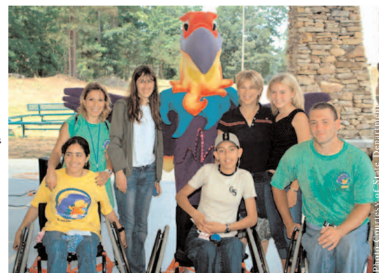
Disabled athletes attend BlazeCamp in Atlanta, GA in 2004.

FOR ADDITIONAL INFORMATION ON ECA'S MORE THAN 30,000 EXCHANGES, VISIT OUR WEBSITE AT WWW.EXCHANGES.STATE.GOV