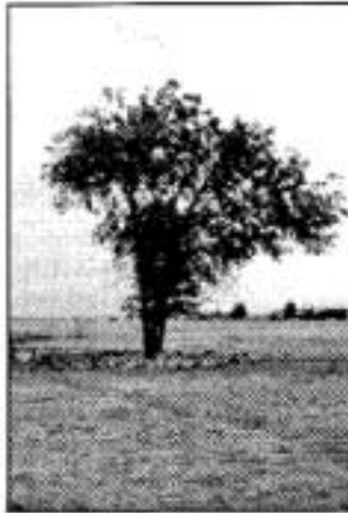
Figure 4. Poen Road 2000 nest tree, 31 July 2000.