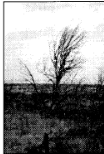
Figure 15. Sand Creek Sec. 23 nest tree used in 1997-1998, 31 July 2000.