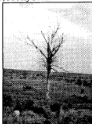
Figure 18. Sand Creek nest tree used in 1998, 31 July 2000.