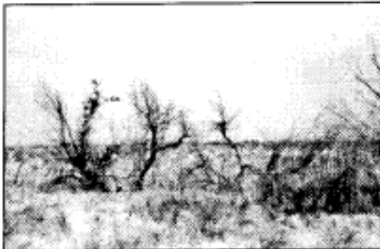
Figure 16. Sand Creek Sec. 23 nest tree used in 1999, 31 July 2000.