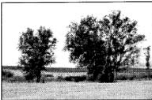
Figure 6. Swan Falls-Kuna Cave nest tree, 31 July 2000. Nest tree used in 1999 on the right and nest tree used in 2000 on the left.