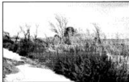
Figure 23. Irrigation runoff from 20-Mile Farm near the Sand Creek Sec. 23 nesting territory, 31 July 2000.