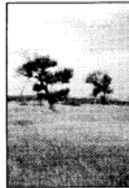
Figure 13. Kuna Cave nest trees, 31 July 2000. Nest tree used in 1997 - 1998 on the left, 1999 - 2000 on the right