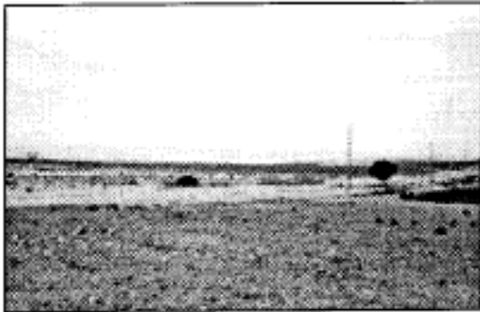
Figure 14. Water source for Kuna Cave nesting territory, 31 July 2000.