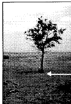
Figure 19. Elm tree showing cattle damage in the Kuna Butte Sec. 13 nesting territory, 31 July 2000. Note the rubbed bark and lack of vegetation around the roots.