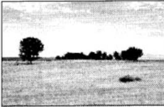
Figure 20. Trees in the Cloverdale nesting territory, 5 July 2000. 1996 nest tree on the far right.