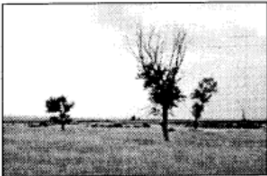
Figure 12. Cottonwood tree just north of Sand Creek Tree nest tree, showing cattle damage, 31 July 2000.