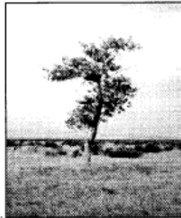
Figure 11. Kuna Cave nest tree, 31 July 2000.