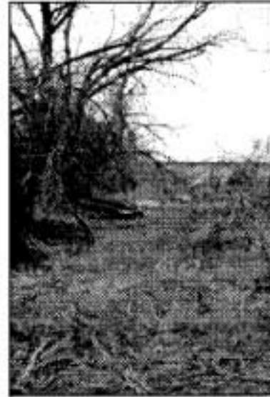
Figure 21. Dead willow trees along Sand Creek near the Sand Creek Sec. 23 nesting territory, 31 July 2000.