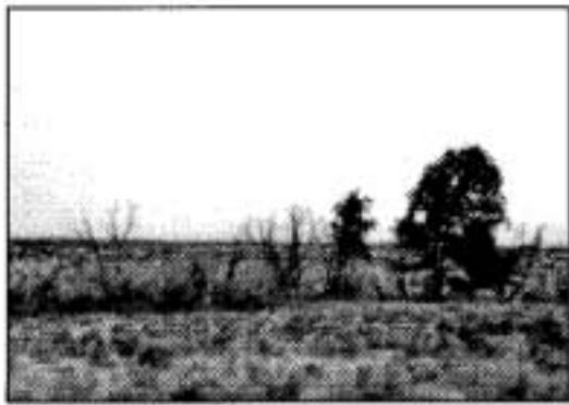
Figure 5. Sand Creek Sec. 23 nest tree, 31 July 2000. Nest tree on the right.