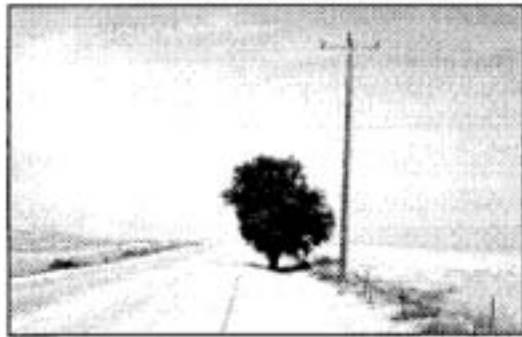
Figure 7. Swan Falls-Nicholson nest tree, 31 July 2000.