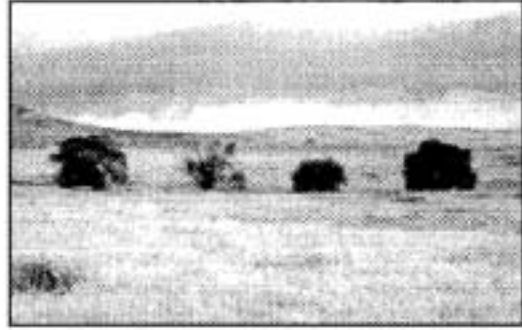
Figure 3. Kuna Butte SE nest trees, 31 July 2000. Nest tree in 1999 on the right and 2000 nest tree on the left.