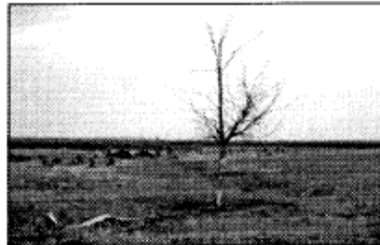
Figure 17. Dead cottonwood tree just north of Sand Creek Tree nest tree, showing cattle damage, 31 July 2000.