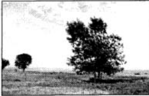
Figure 2. Cloverdale Dairy nest tree, 5 July 2000