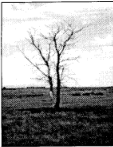
Figure 10. Sand Creek Tree nest tree used in 1997 and 1999, 31 July 2000. Tree died in 2000