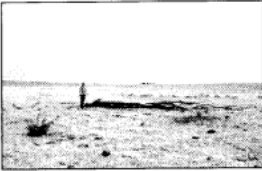
Figure 8. Kuna Butte Sec. 13 nest tree, 31 July 2000. Tree was killed in the 1995 Point Fire.