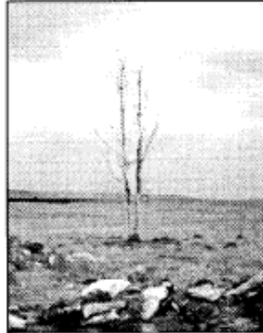
Figure 9. Poen Road 1995 nest tree, 31 July 2000. Tree was killed in the 1995 Point Fire.