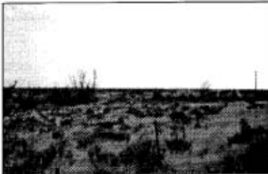
Figure 22. Former water source for the Sand Creek Sec. 23 nesting territory, 31 July 2000.