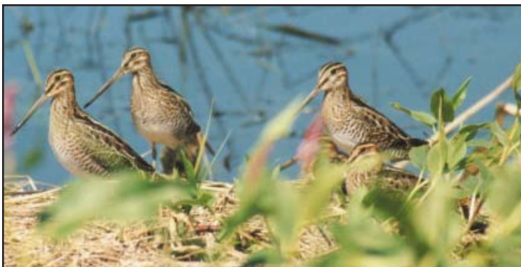
- USFWS photo

Fall surveys began July 11. The majority of the shorebirds were using flooded fields. Only one scheduled drawdown pool was available for shorebird use in late August. In September, several others became available. Final results of fall census are not available yet. Margaret Anderson, Agassiz NWR