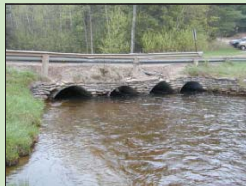
- USFWS photo by Heather Enterline

The Thunder Bay River/McMurphey Road Crossing has