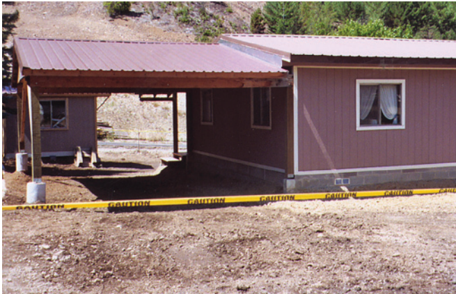
Many homes are having contaminated topsoil replaced with safer materials.

Cleanup of Bunker Hill Operable Unit 3 (the Basin) has been a top priority for EPA since the cleanup plan was finalized in 2002. This past year, planning began for cleanups at two Lower Basin recreation areas, as approved under the Basin Commission's first one-year work plan. The Basin Commission is a team of representatives from the states of Idaho and Washington, three counties in the Basin, the Coeur d'Alene Tribe, and federal agencies. The Commission's objective is to establish clean and low-maintenance recreation sites for public use.