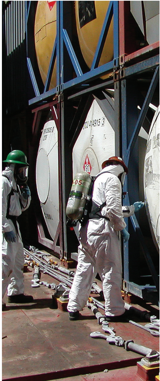
EPA monitors vapors on the Axel Maersk cargo ship to protect Port of Tacoma employees and the surrounding community.

When EPA staff arrived on board, they helped to find, isolate, and contain the source of the hazard. EPA also monitored the air to protect Port employees and the surrounding community. EPA and the Coast Guard determined that one of the containers on the ship released vapors due to high internal pressure. EPA helped move the container to a quarantined area on the dock for re-certification. Due to the fast response by all parties, the Axel Maersk was able to resume business and leave Tacoma three days after the incident.