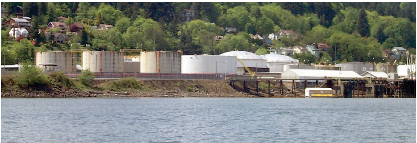
EPA will use fish tissue data to help determine sediment cleanup levels at Portland Harbor.

Progress at Portland Harbor stems from close teamwork on many fronts. EPA and the Oregon Department of Environmental Quality are cooperating with citizens, tribes, and public agencies to ensure that the investigation incorporates a wide range of concerns. Six tribes and several federal and state agencies work in partnership with EPA to resolve technical issues regarding work plans and collection of sediment samples.