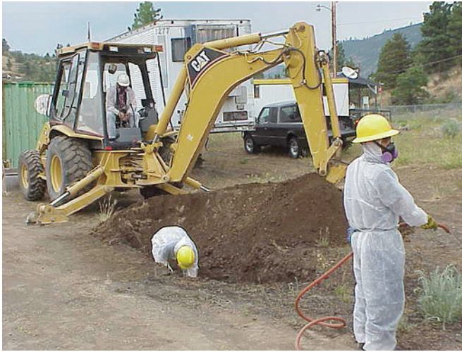
EPA takes fast action to remove asbestos from the North Ridge Estates neighborhood.

In summer 2003, EPA took action to remove asbestos contamination from 22 residences in the North Ridge Estates neighborhood near Klamath Falls. The Oregon Department of Environmental Quality asked EPA to get involved when it learned that asbestos-laden debris throughout the subdivision could threaten the health of residents. EPA's work included removing more than 14,000 pounds of asbestos-containing materials from residential properties, and sampling air and soil to see if people were at risk.