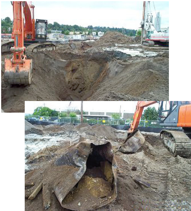
Prior to cleanup, soils at Frontier Hard Chrome were stained with contamination.

EPA has completed cleanup of hexavalent chromium at the Frontier Hard Chrome Superfund site in Vancouver. Years of improper chrome disposal had contaminated groundwater and threatened the Columbia River. Today, the property is fenced and ready for light industrial or commercial reuse. By using innovative cleanup technologies, EPA spent $3.5 million, rather than the projected $30 million it could have spent using traditional methods.