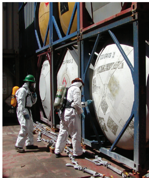
Bottom left cover photo contributed by Dan Rone.