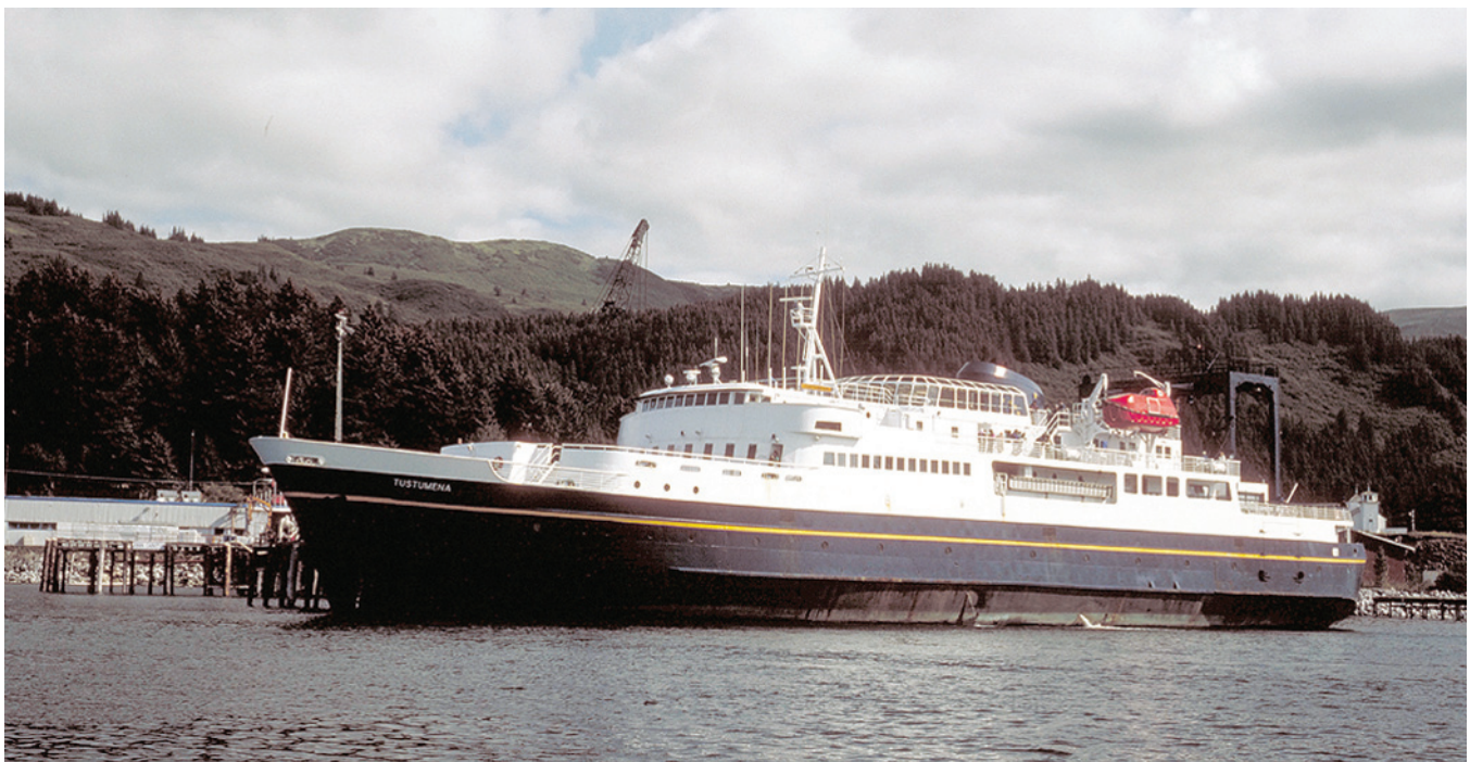
Adak's ice-free, deep-water port invites commercial growth.

Completing the first phase of unexploded ordnance cleanup was an important step in making the Adak property transfer possible. The Navy removed 351 intact military munitions from WWII, including grenades, mortars, and projectiles. It also removed 3,300 metal fragments from training areas, including partially intact munitions that did not completely explode after being fired. The first cleanup phase addressed all of downtown Adak and all the real estate scheduled for transfer. EPA's collaboration with the Navy, the Aleut Tribes, the State, local business, and the community has been critical to expediting the cleanup and making the island safer for everyone.