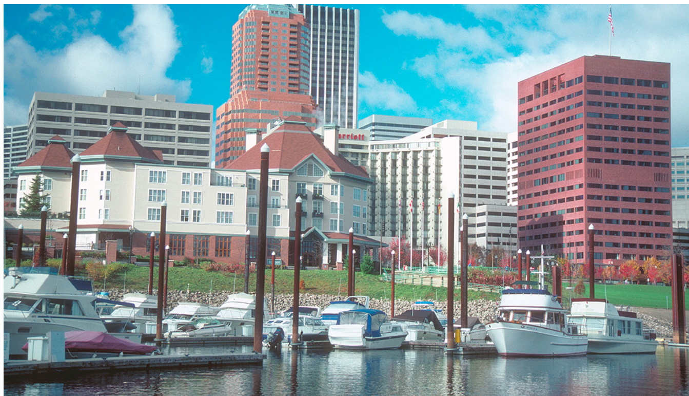
The Willamette River is an aesthetic and recreational highlight for Oregon.

Tasks planned in the final cleanup phase include installing 15 groundwater circulation wells, constructing a clean soil cap, and restoring a wetland. The circulation wells will remove volatile organic compounds and prevent contamination from spreading off site. The soil cap will be spread two feet deep over an area larger than 12 football fields. It will protect future occupants from exposure to coal-tar compounds and PCBs. The wetland will provide habitat for endangered species.