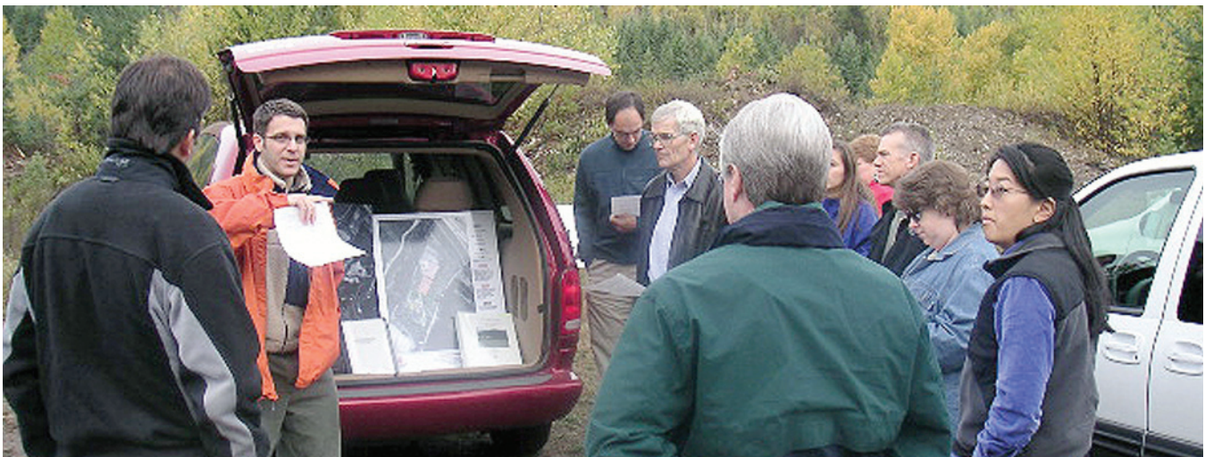
EPA employees discuss cleanup in the Coeur d'Alene Basin.

In non-populated areas of the Box, work is nearly complete. Revegetation efforts have been extremely effective. New plants and animals are flourishing in areas that have been devoid of life for decades.