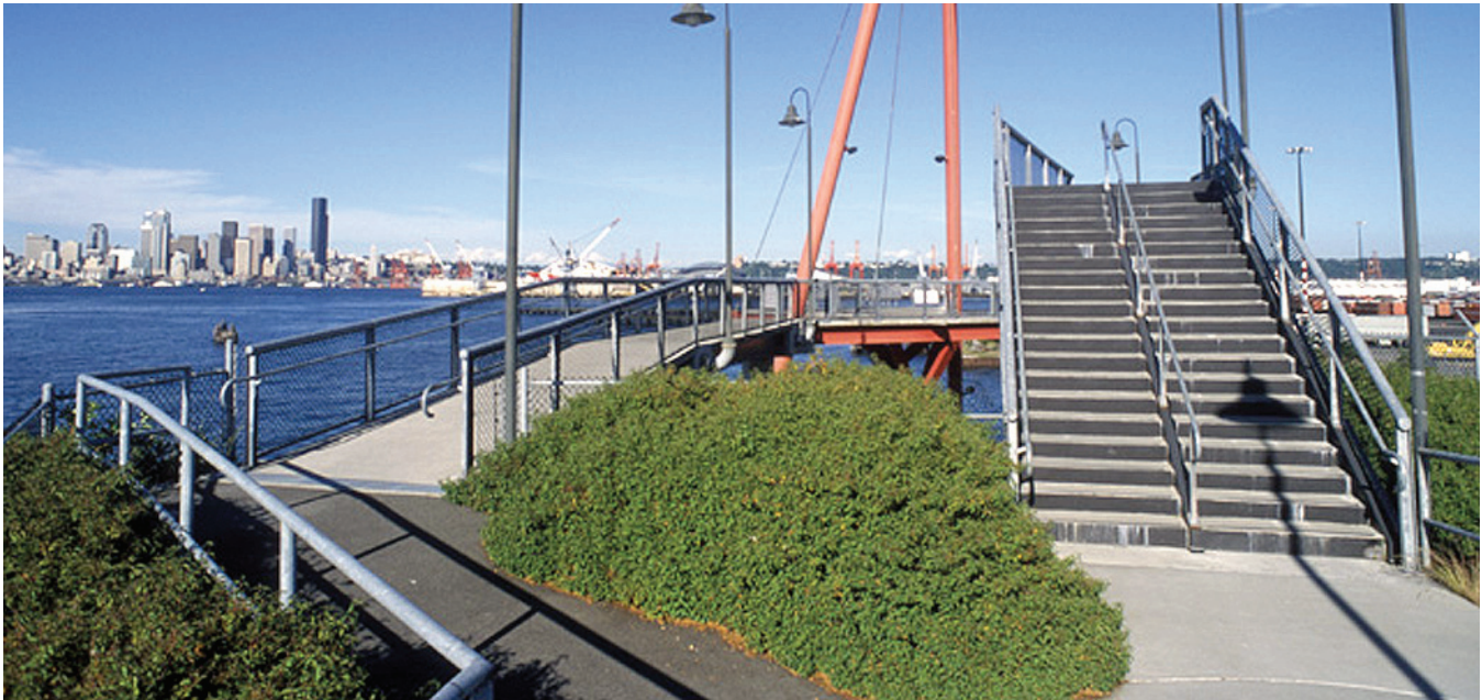
People can watch the cleanup of Pacific Sound Resources from the public-access park and viewing tower at the site.