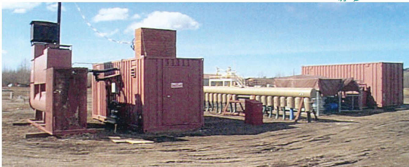
Work at Fort Wainwright has stimulated the local economy, as local contractors are doing the bulk of cleanup.