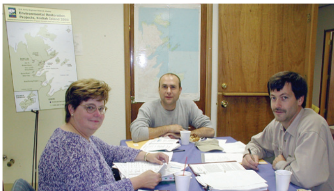
Staff from EPA, the Army Corps, and the Alaska Department of Environmental Conservation discuss prioritizing cleanups at FUD sites.

In a landmark bargain for progress, EPA Region 10, the U.S. Army Corps, and the Alaska Department of Environmental Conservation crafted and signed the first Statewide Management Action Plan for prioritizing cleanups at the 625 Formerly Used Defense Sites (FUDS) across Alaska. Implementing the action plan will produce several tangible results: the agencies will be much more strategic and productive in their cleanup approach; sites posing the highest risks to communities will be addressed more quickly; and due to greater efficiencies, taxpayer dollars will be saved.