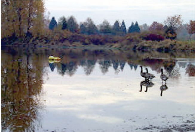
Toxic contamination threatens Force Lake.

In September 2003, EPA added the Harbor Oil site to the National Priorities List, making it Oregon's newest Superfund site. The site is located near the Expo Center in northeast Portland. The Oregon Department of Environmental Quality referred the site to EPA when it was unable to reach a cleanup agreement with the owner. In deciding to list the site, EPA considered input from the community, tribes, and state and local agencies.