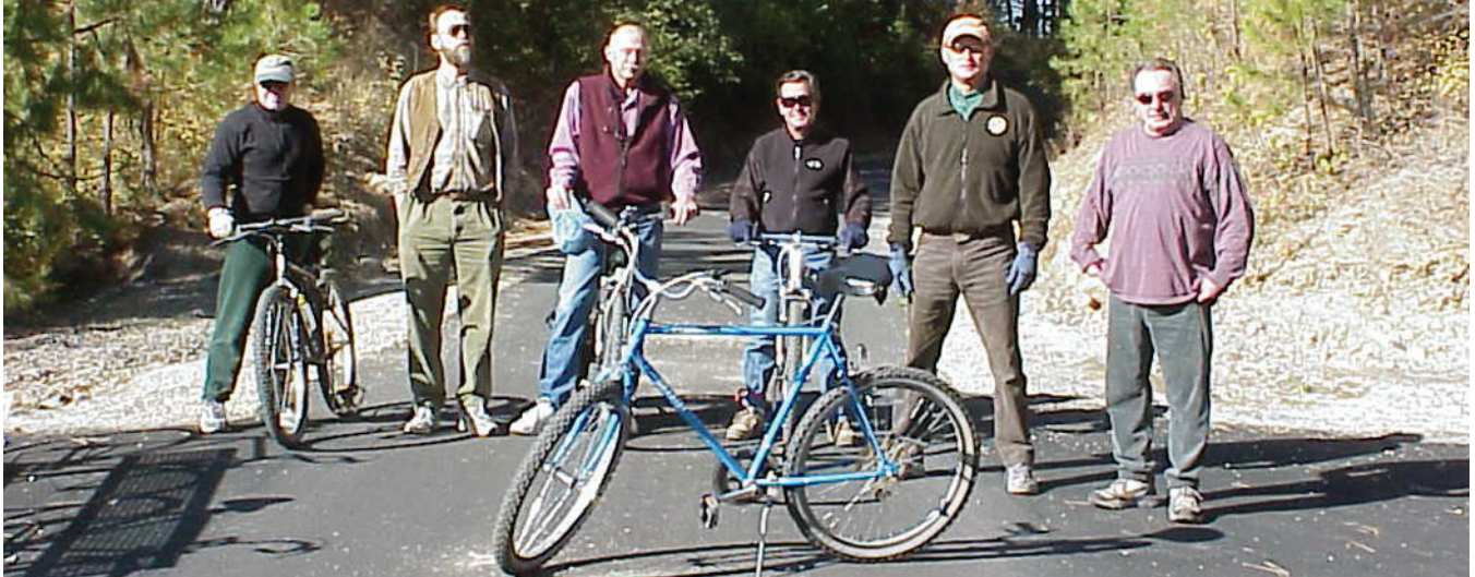
Local businesses and residents in and around Kellogg and Coeur d'Alene enjoy the new 72-mile recreational trail.

wastes have been consolidated on site under a protective barrier. The barrier is minimizing the release of lead and arsenic into Blue Joe Creek. To protect fisheries, state and federal agencies will monitor water quality for several years.