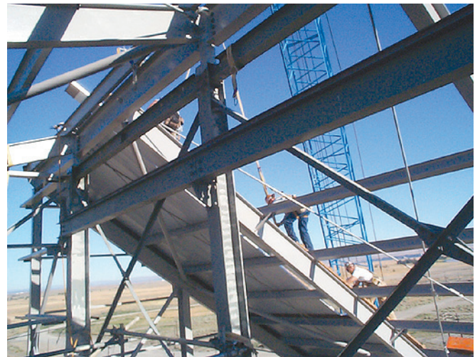
This year the Department of Energy cocooned a third nuclear reactor.

The Department of Energy finished cocooning a third nuclear reactor at the 586-square-mile Hanford Nuclear Reservation, which is the most contaminated nuclear waste site in the United States and the site of the world's largest environmental cleanup. Cocooning involves tearing the reactor down to the 3-foot concrete shield wall, and putting a safe, secure structure of galvanized steel on top of it.