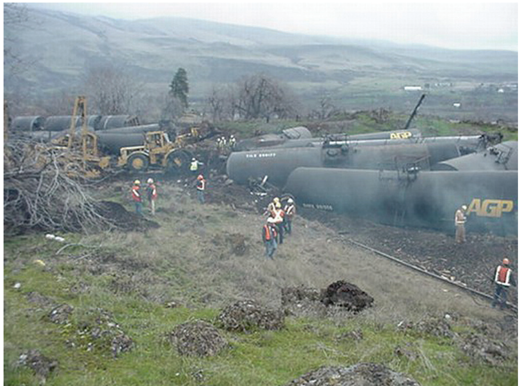
EPA responds at a train derailment where freight cars containing oils and hazardous materials jumped the track.

The derailment occurred in a culturally significant area within the Columbia Gorge National Scenic Area. The Yakima, Warm Springs, and Umatilla Indian tribes have cultural and historic connections to the area. During the cleanup, the Unified Command made sure that culturally and historically significant items weren't disturbed. At the tribes' request, EPA also made sure that soils removed from the site were returned after they were treated.