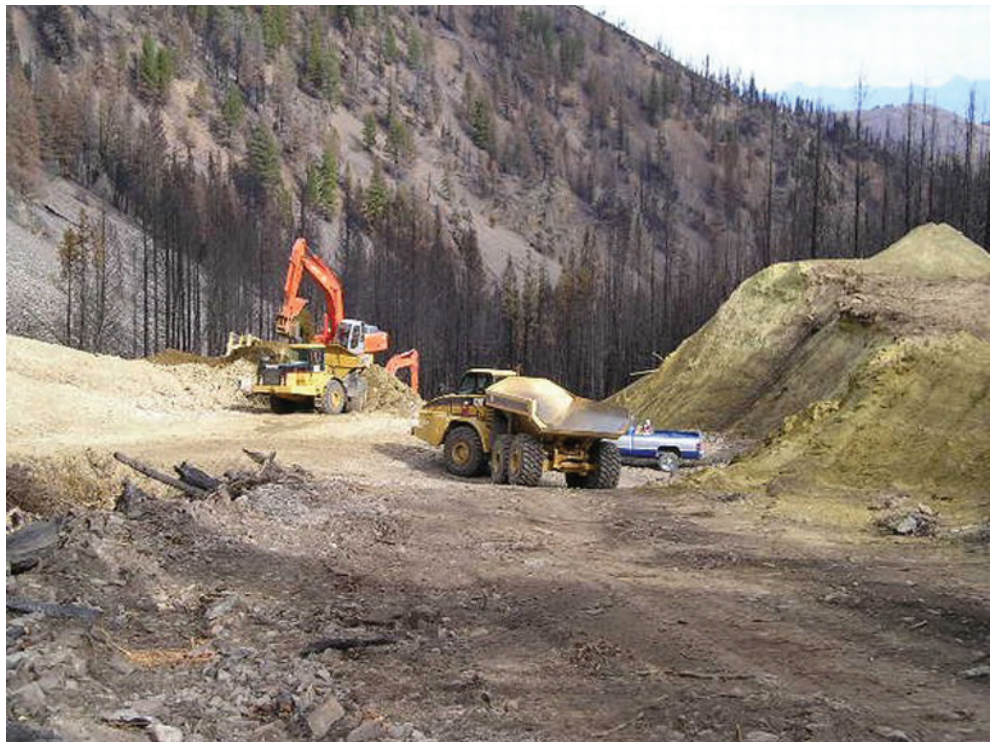
A fast cleanup at the Harmony Mine protects downstream waters from copper contamination.

In just two months, EPA and the U.S. Forest Service co-led a $500,000 cleanup to remove the tailings, place them in a secure repository, and cap them. The agencies built a 1.3 mile road so that large construction equipment could get to the site. They also reconstructed the stream channel to be stable and seeded disturbed areas.