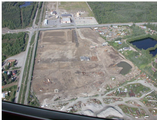
Today the Arctic Surplus Site is safe, clean, and ready for industrial redevelopment.

To make the site available for a wide variety of future activities, EPA approved a redesigned cap for the on-site hazardous waste containment area. Due to EPA's modifications, the property owner can now use this area for parking, storage, and other business needs.