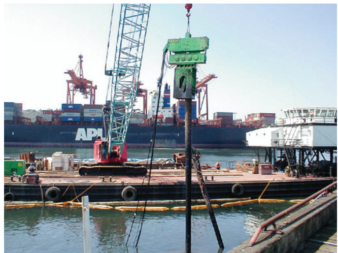
Cleanup at the Harbor Island Superfund site includes removing about 8,000 creosoted piles.

EPA signed two legal agreements this past year that make these major cleanups possible. Cleanup plans include removing four-plus acres of piers, removing about 8,000 creosoted piles, dredging more than 300,000 cubic yards of contaminated sediments, capping more than four acres of contaminated sediments, and improving habitat for salmon.