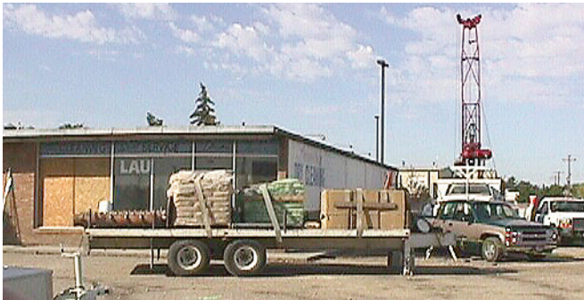
The results of a rapid investigation at Franke's Laundromat are helping EPA and others determine next steps.

In Spring 2003, EPA negotiated a legal agreement with the property owner of Franke's Laundromat to do a rapid site investigation. EPA got involved due to dangerous levels of perchloroethylene (PCE) in soil and groundwater at the site. Since PCE is highly toxic and a probable carcinogen, EPA is concerned about off-site migration and the threat to down-gradient drinking water and the air inside nearby businesses.