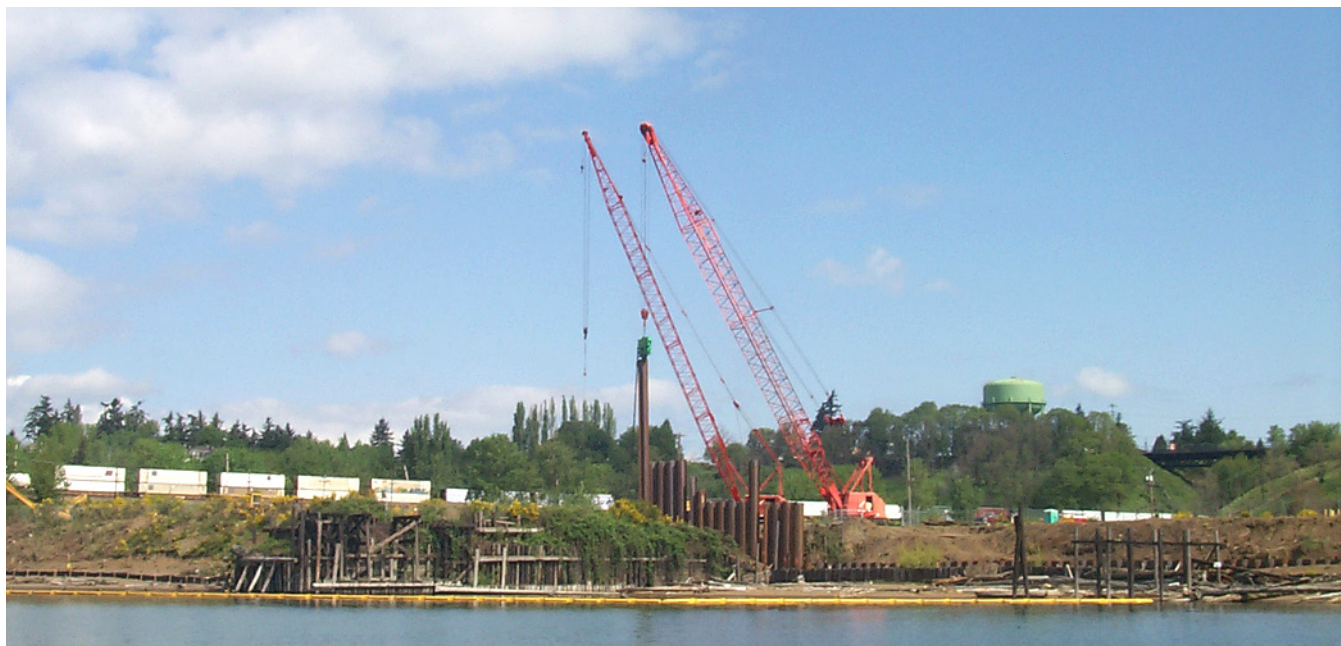
The sub-surface barrier wall at McCormick and Baxter will prevent toxic substances from seeping into the Willamette River.

EPA took fast action to secure and stabilize the site by controlling water accumulation and covering open containers filled with cyanide and hydrofluoric acid. The Agency has pumped storm water into above-ground tanks. It also removed and properly disposed of approximately 70,000 gallons of hazardous waste liquids. The Fire Marshall's office expressed satisfaction with EPA's quick response. The site no longer poses a threat to neighbors and workers, and EPA is helping to put the site back into productive use.