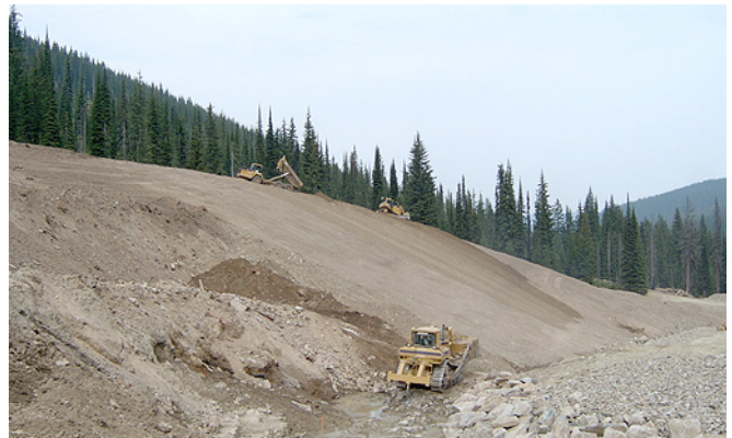
EPA consulted formally with the Kootenai Tribe and the Canadian government to complete a rapid cleanup of Continental Mine.

EPA has worked closely with the State of Idaho and the Coeur d'Alene Tribe on this project. In addition to cleaning up contaminated sites along the railway, the project has involved building or repairing 30 bridges and constructing solar-powered, composting toilets.