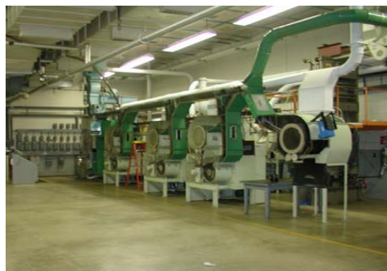
Micro-gin lint cleaners

For the next five years, the Cotton Ginning Lab will pursue goals of enhancing and improving the gin technology available both to domestic and foreign producers as part of ARS National Program 306. The current objectives include evaluating cotton varieties to determine their response to standardized gin machinery, improving and testing recently developed, patented technology, further augmenting the computerized gin process control system, and promoting the environmental friendliness of gins. By evaluating different cotton variety production, tillage and harvest practices, the impact of standard and non-standard gin machinery can be ascertained.