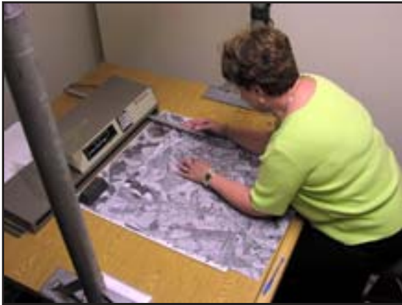
Paper maps that required staff to manually transfer information are being replaced with computer-based mapping tools.

In addition, GIS and GPS technology can help agricultural producers improve production history and farm planning through precision agriculture. Producers