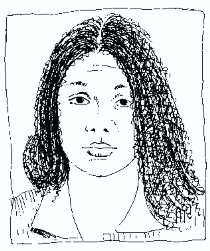
Obsessive-Compulsive Disorder NIH Publication No. 00-4676