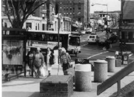
Neighborhoods like Adams-Morgan in the District of Columbia have experienced gentrification in recent years.

Transit-oriented development policies—clustering higher-densities around transit stations—are already well-established in Montgomery and Arlington counties. But the effects of such policies on low-income people may not always be positive. In the western parts of the Washington region, Metrorail stations have been a significant factor in raising